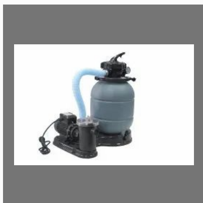
Swimming Pool Filtration Service