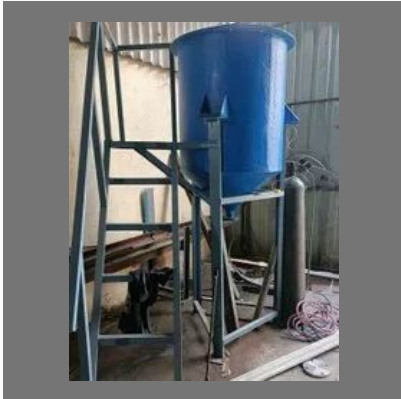
Automatic Effluent Treatment Plant