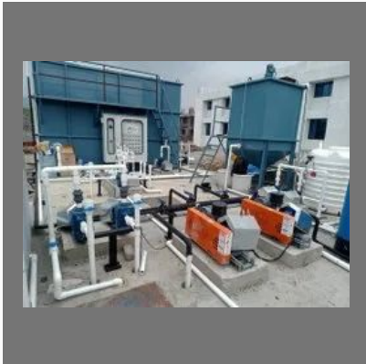
Automatic Sewage Treatment Plant