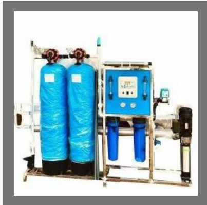
Industrial RO Plant