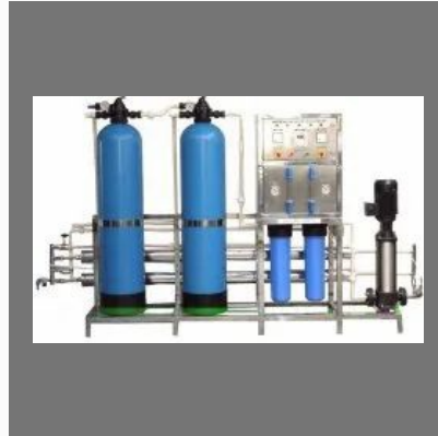
Automatic Industrial Ro Plant