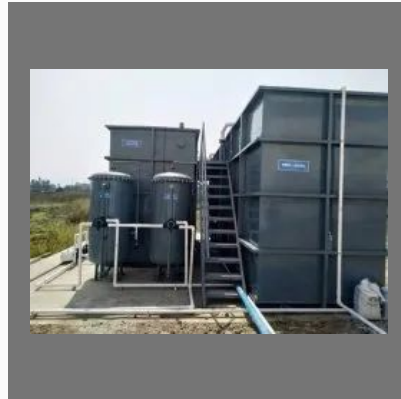
100KLD Sewage Treatment Plant