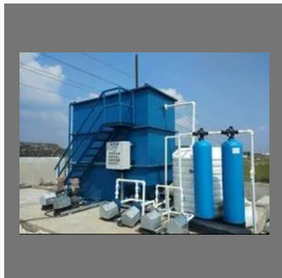
50KLD Wastewater Treatment Plant