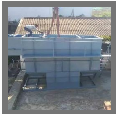
RO Water Treatment Plant Maintenance Service