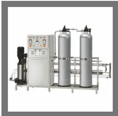
220V Industrial Reverse Osmosis Plant