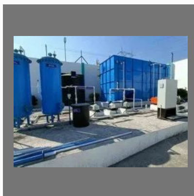
RO Water Treatment Plant Installation Service