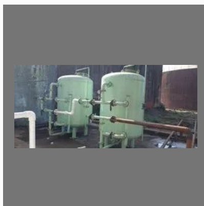
Automatic Dual Water Softener Plant