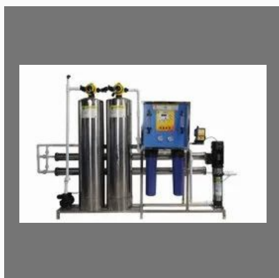
Stainless Steel Reverse Osmosis Plant