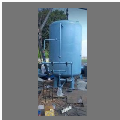
Water Treatment Plant