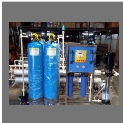
Automatic Reverse Osmosis Plant