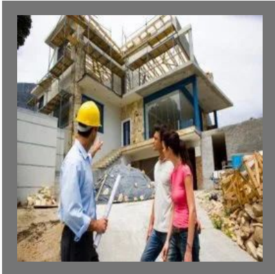
Residential House Construction Services