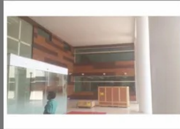
Modular Kitchen Designing