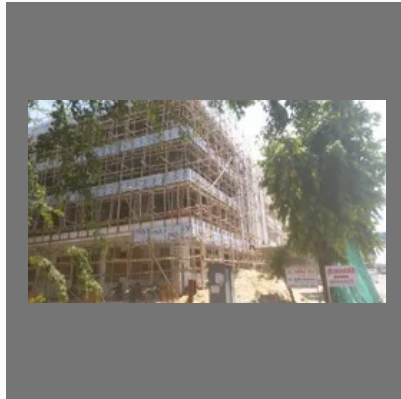
Civil Constructions Service