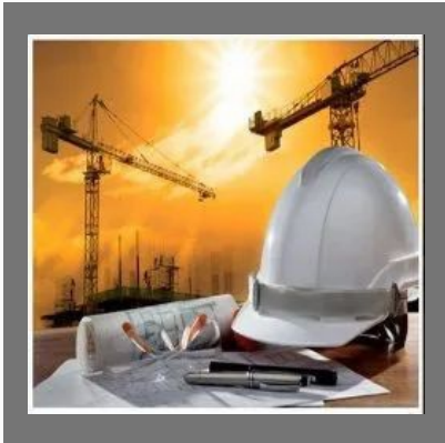
Civil Work Contract Service