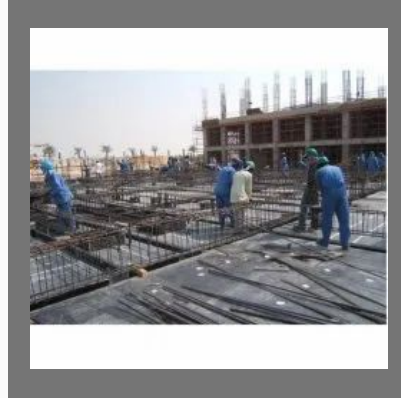
Industrial Civil Work Services