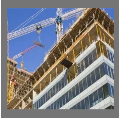
Commercial Civil Work Service