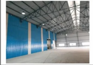
Sheet Metal Roofing Fabrication Service