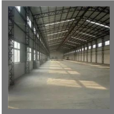
Iron Shed Fabrication Services