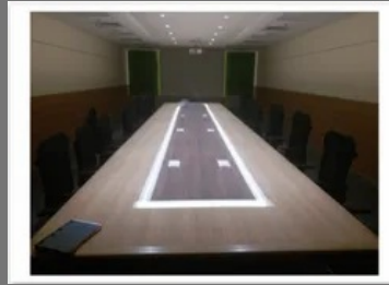
Modern Office Interior Designing Service