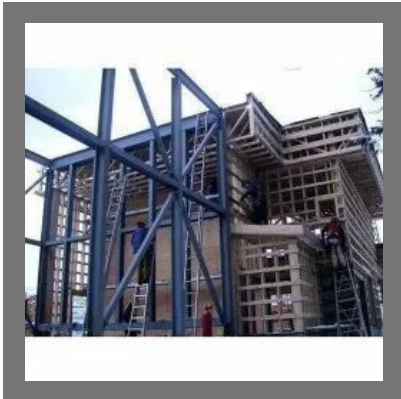
Industrial House Construction Service