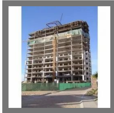
Commercial House Construction Service