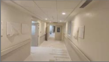
Hospital Building Interior Designing Services