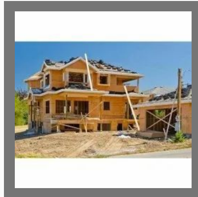
Individual House Construction Service