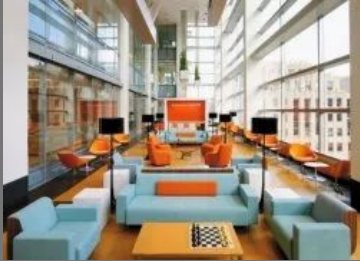
Commercial Interior Designing Service