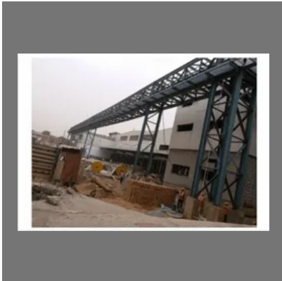
Heavy Structural Steel Fabrication Service