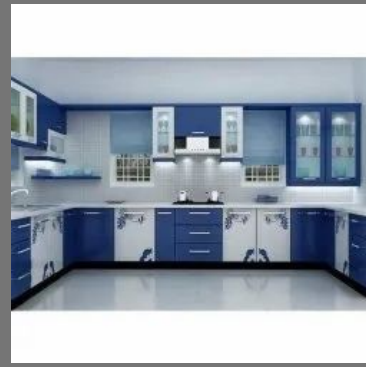
Modular Kitchen Designing Services