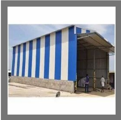
Industrial MS Shed Fabrication Service