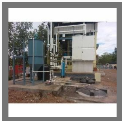
Industrial Effluent Treatment Plant