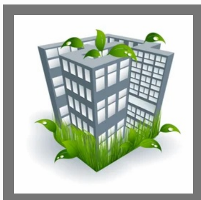
Green Buildings Consultancy