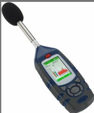
Noise Level Monitoring