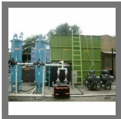
Automatic Sewage Treatment Plant