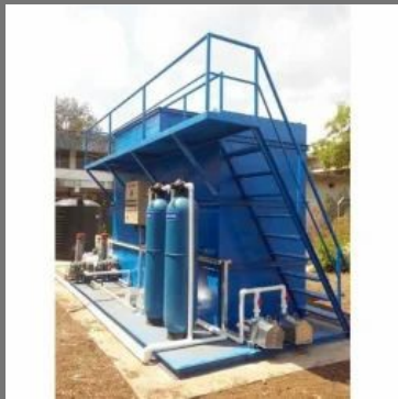
Industrial Sewage Treatment Plant