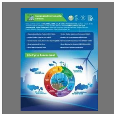
PRODUCT LIFE CYCLE ASSESSEMENT (LCA)