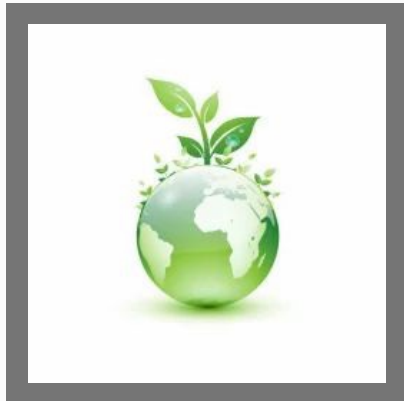
Environmental Consultant Service