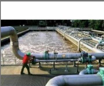
Sewage Treatment Plant Maintenance Service