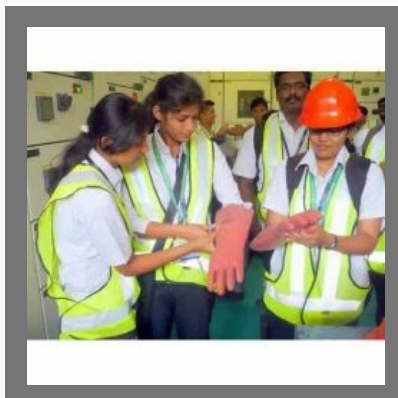
Industrial Safety Audit