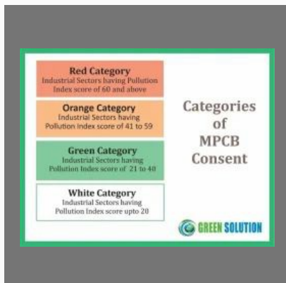
MPCB Consent- Consultancy