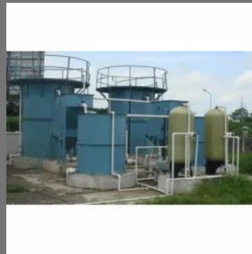
Sewage Waste Water Treatment Plant