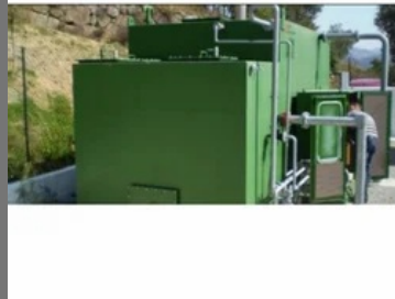
Compact Water Treatment Plant Maintenance Service