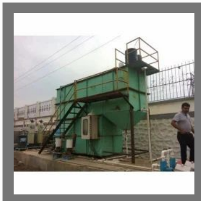
STP Plant Maintenance Service