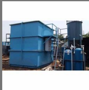
Sewage Waste Water Treatment Plant