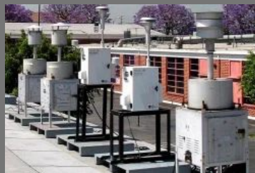
Ambient Air Quality Monitoring