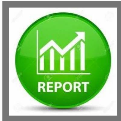
ESR Environmental Survey Report (Form 5)