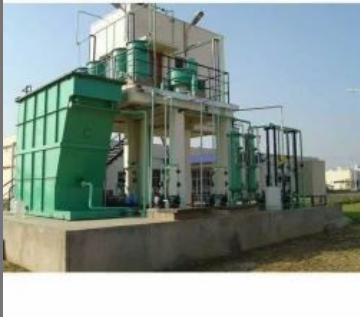
Water Treatment Plant Maintenance Service