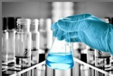
Water Testing Services