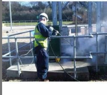
Effluent Treatment Plant Maintenance Service