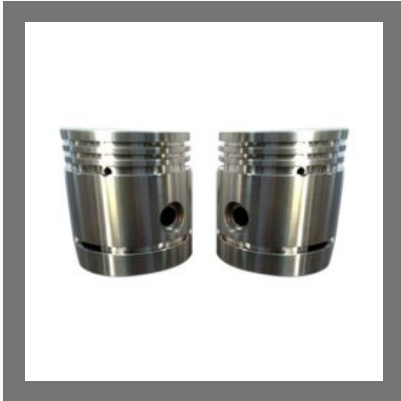
Heat Treated Elgi Compressor Piston