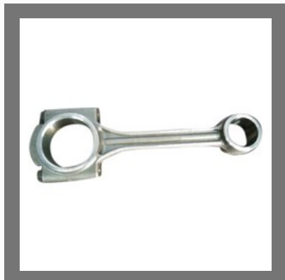
Atlas Copco Engine Connecting Rod