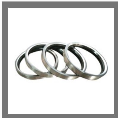
Tata Indica Valve Seat Inserts