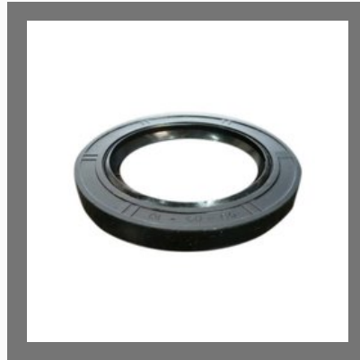
Atlas Copco Oil Seal