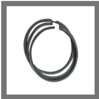
Tata Indica Piston Ring Set