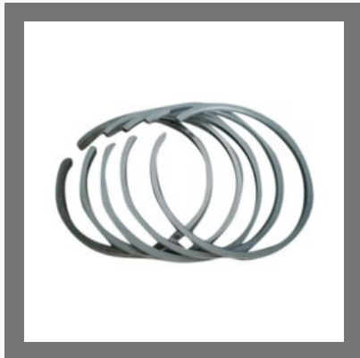
Elgi Air Compressor Piston Rings 100mm