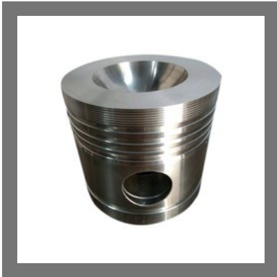
Diesel Engine Piston