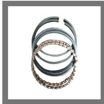
Ingersoll Rand Piston Rings