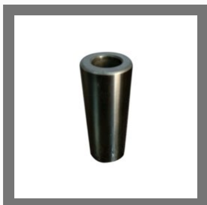
Atlas Copco Piston Pin