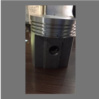
220mm Atlas Copco Engine Piston