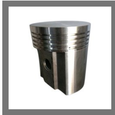
Atlas Copco Compressor Piston