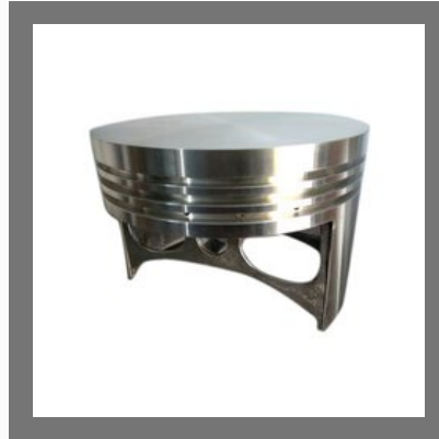
Atlas Copco Compressor Piston