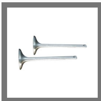
Tata Indica Engine Valve