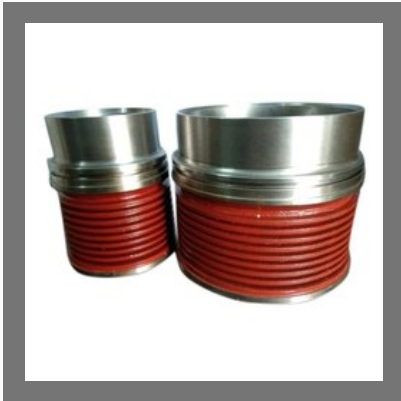
Atlas Copco Cylinder Liner Honing