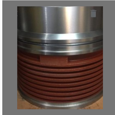
Air Compressor Cylinder Liner