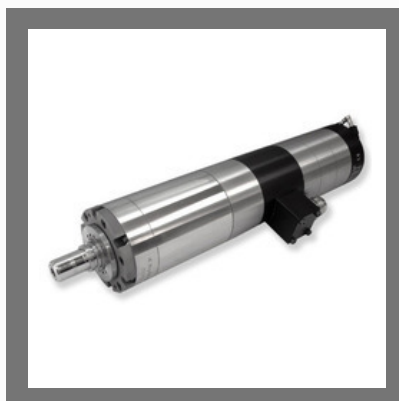
High Frequency Spindle