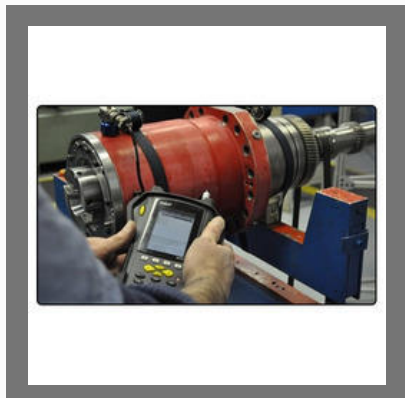
Spindle Reconditioning Service