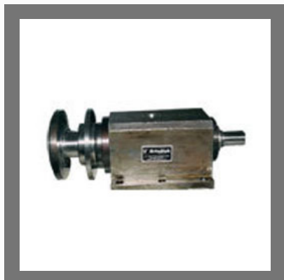
Precision Turning Spindle