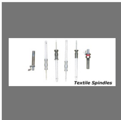
Precision Textile Spindles