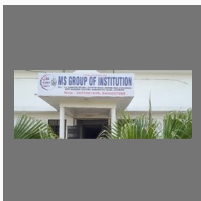
Cms Ed Jaunpur, saharanpur, Varanasi