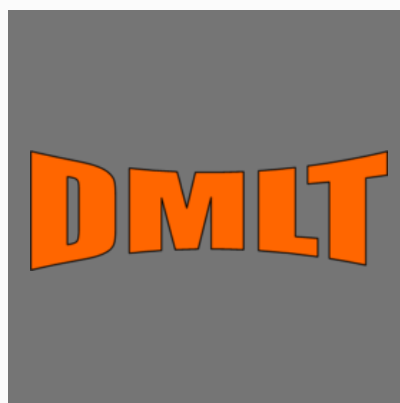
DMLT Diploma In Medical Laboratory Technology