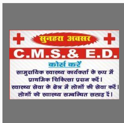
Doctor Allopathy Course Karnataka