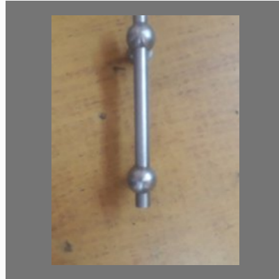
S S 304 Pull Handle