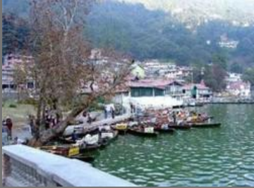
Nainital Package Tours