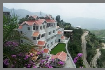
Fascinating Shimla (2N/3D)