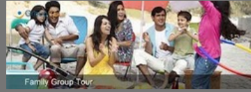
Customized Domestic & International Package Tours For Differ