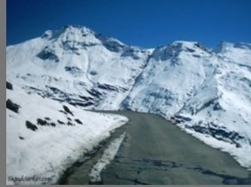
Best Deals Of Manali (3Nights)