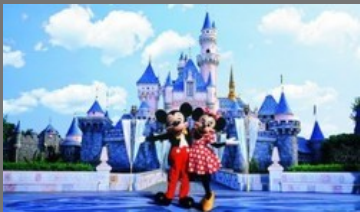
Explore Hong Kong