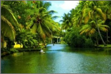
Gods Own Country Kerela