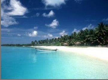
Go Goa Package Tours