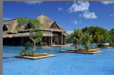
Mauritius Package Tours