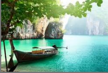
Amazing Bangkok / Pattaya