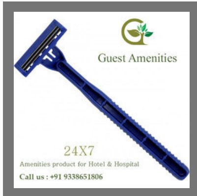
Disposable Hotel Shaving Razor