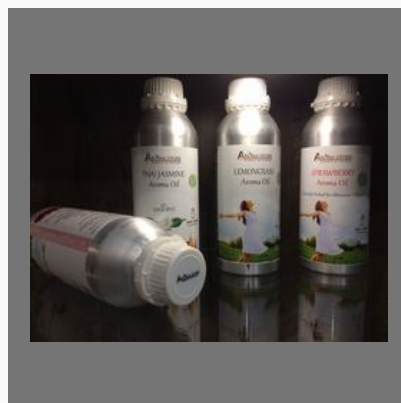
Spa Body Massage Oil Regular