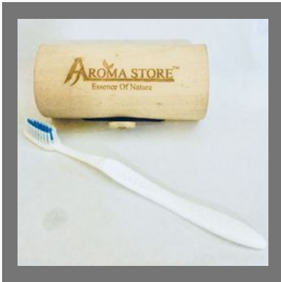
Hotel Disposable Tooth Brush