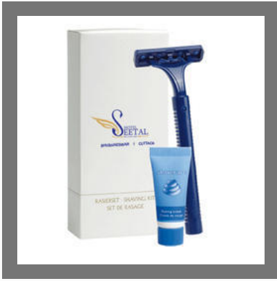
Hotel Shaving Kit