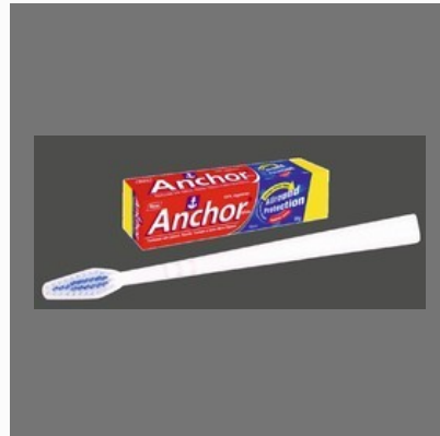
Hotel Dental Kit With 10gm Anchor Tooth Paste and Tooth Brush