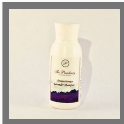
20ml Hotel Shampoo With