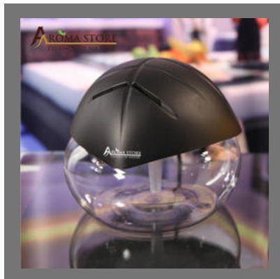
Aroma Diffuser With Air Purifier