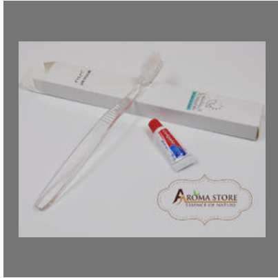
Hotel Dental Kit With 10gm Colgate Paste & Brush