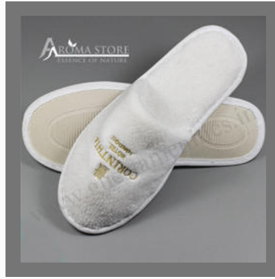
Hotel Disposable Bath Slipper