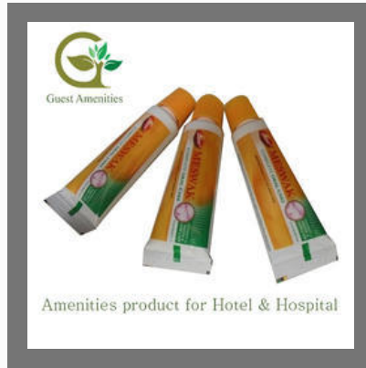
10GM Dabur Meswak Tooth Paste ( For Hotel & Hospital )