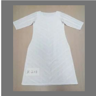
White Cotton kurti