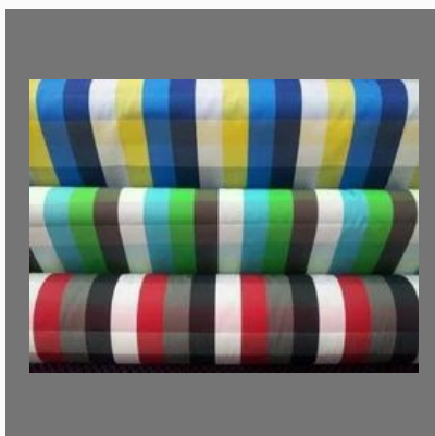
Yarn Dyed Shirting Fabrics