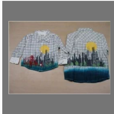
Stock Boys Shirt