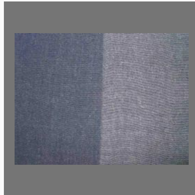
Chambray Denim Fabric