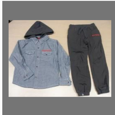
Morgan Shirt Pant Set