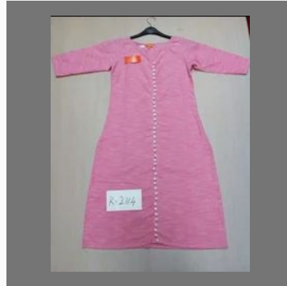
Womens Cotton kurtis