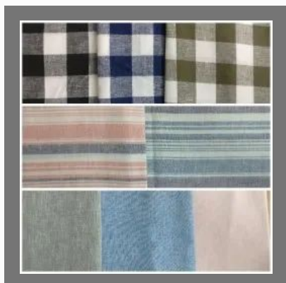
Linen & Cotton Fabric