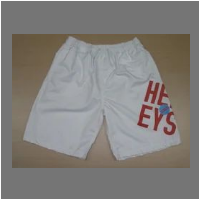
Henley Swim Short White