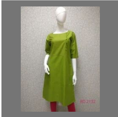
Casual Ladies Kurtis