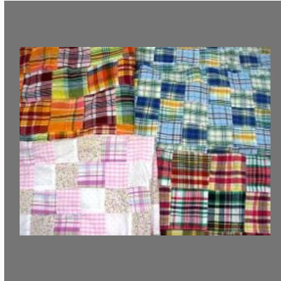
Patch Work Fabric