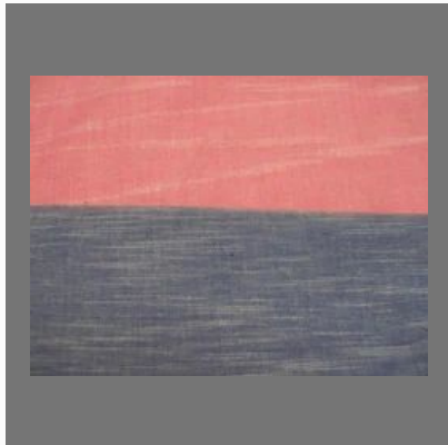
Cotton Slub Fabric