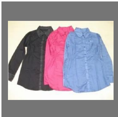
Hurley Girls Shirt