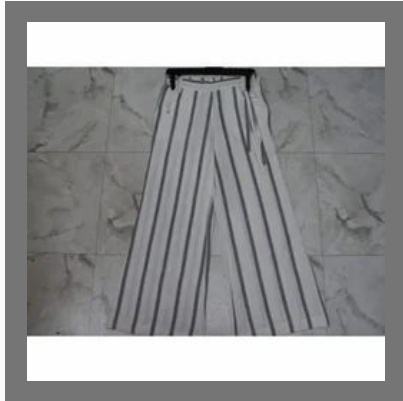
Men Pyjama Pant