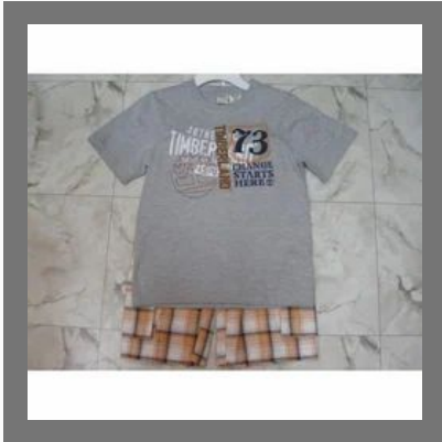
Kids Knit Wear