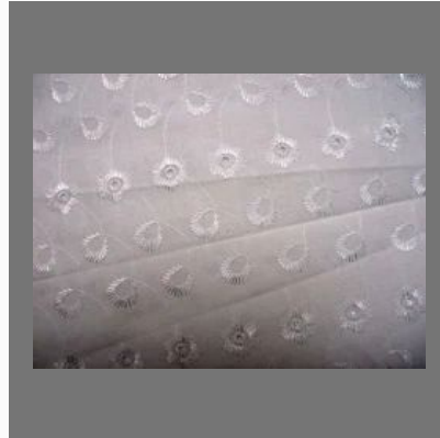
Eyelet Embroidered Fabric