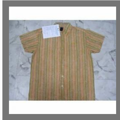
Mens Cotton Shirt