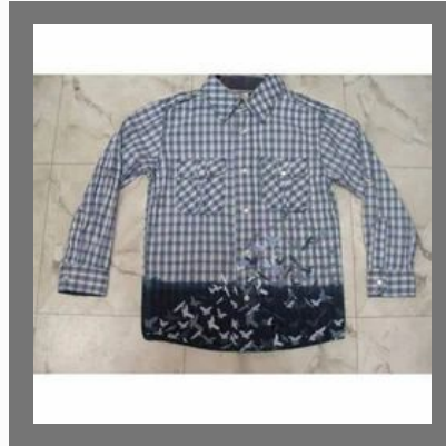
Toddler Dip Dye Shirt