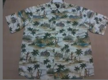
All Over Printed Shirts