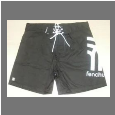
Fenchurch Swim Short Black