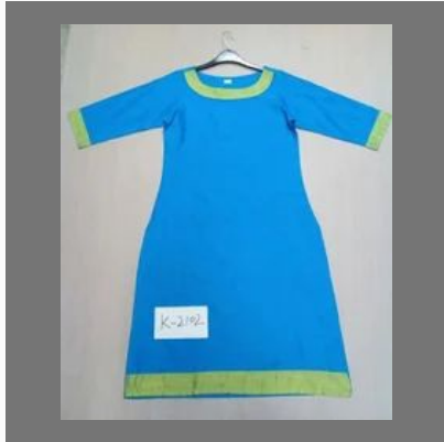
Viscose Ladies Kurti