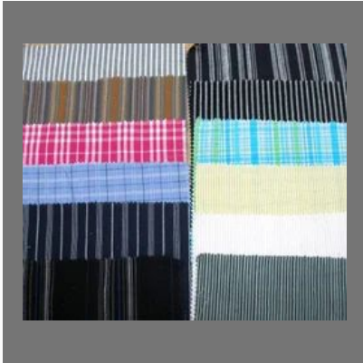
Seer Sucker Fabric