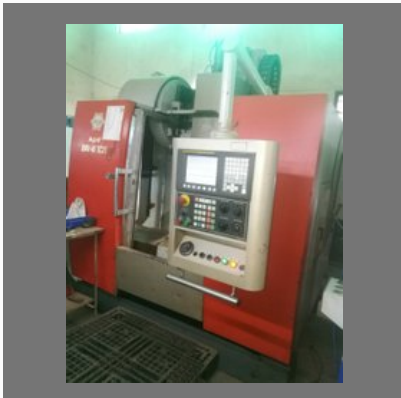
Agni-45 Vertical Machining Center