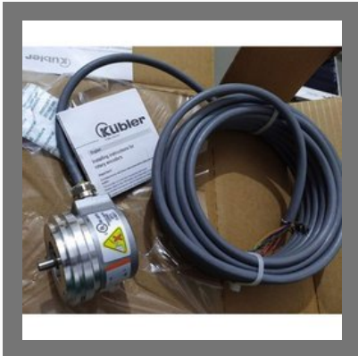
Fanuc Spindle Encoder