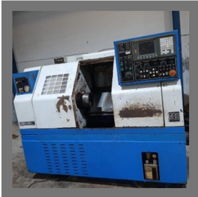
Jobber LM CNC