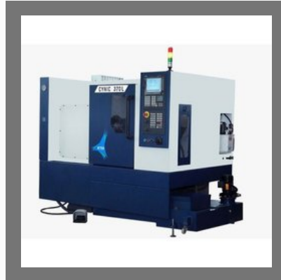
CNC Turning Machine