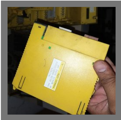
A03B-0807-C011 Fanuc IO Cassette