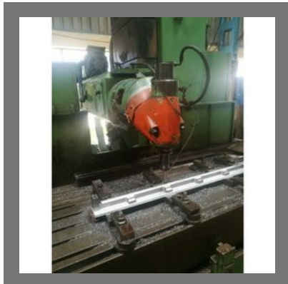
CNC Bed Milling Machine