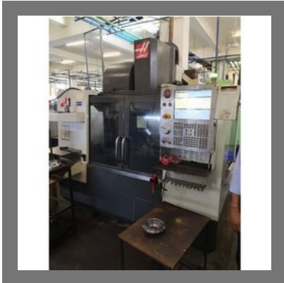
VF1 HAAS VMC Machine