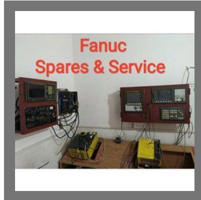
Fanuc Servo Motor Repair Services