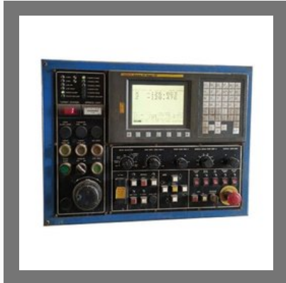
Used Cnc Lathe Machine