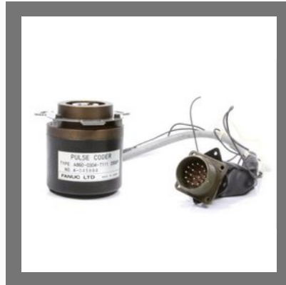
A860-0304-T111 2000P Axis Encoder