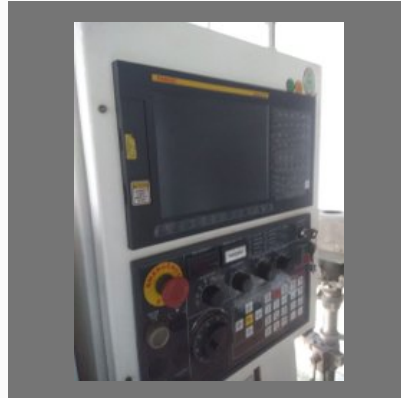
Ace Designer J300 LM CNC