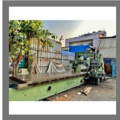
Used Plano Milling Machine