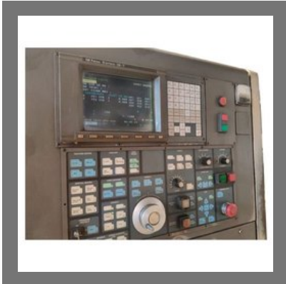
Used CNC Turning Machine