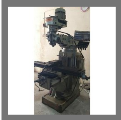
M1TR Milling Machine