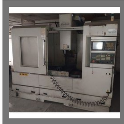
Used VMC Machine