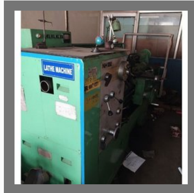
Geared Lathe Machines