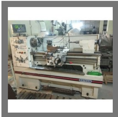
DRO Geared Lathe Machine