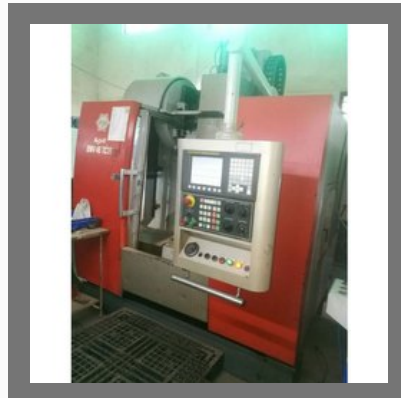
Used Vertical Machining Center