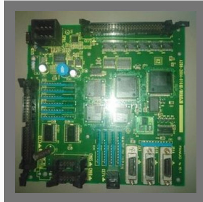
A20B-2004-0160 Fanuc IO card