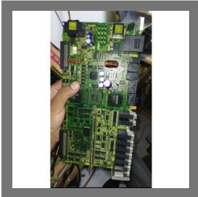
A20B-2101-0710 Fanuc Control Card