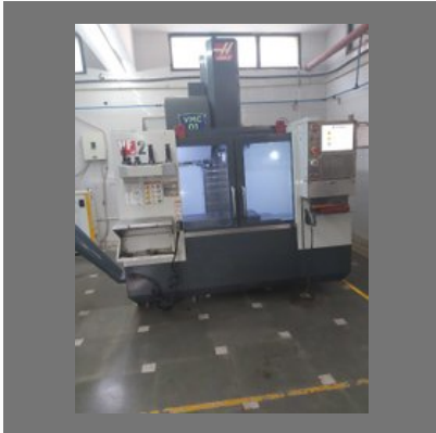
Haas Vf2 Vertical Machining Center