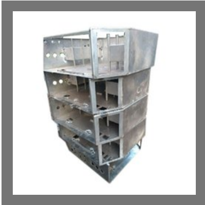
MS Control Boxes