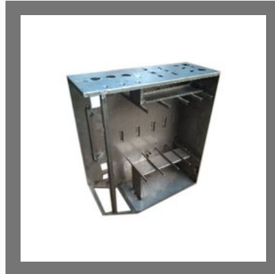
Mild Steel Electric Enclosures