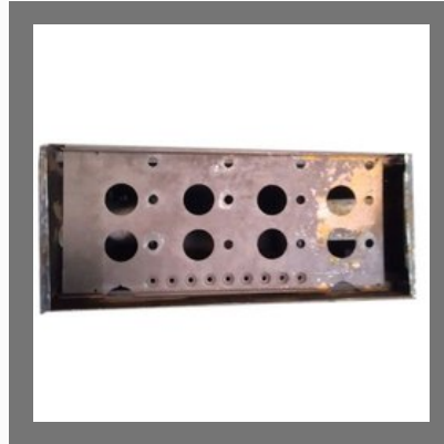
Rectangular MS Electric Enclosures