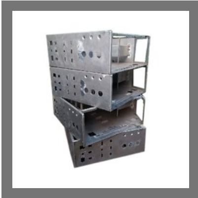
Electric Box Enclosures