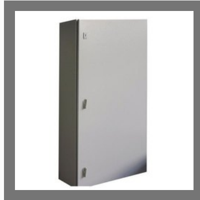
Rectangular MS Control Box