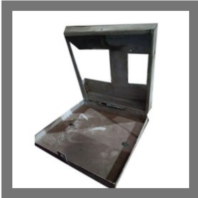
Indicator Control Panel Box