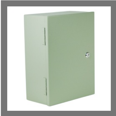
MS Enclosure Control Panel Box