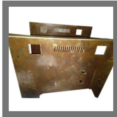
Wall Mounted Electric Enclosures