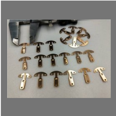
copper sheet metal parts