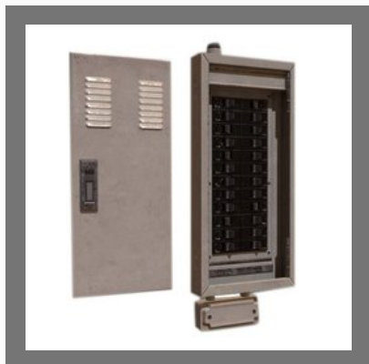
Automotive Electronic Enclosure