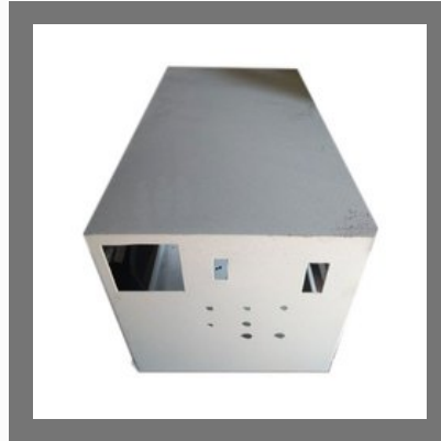
Electrical Control Panel Box