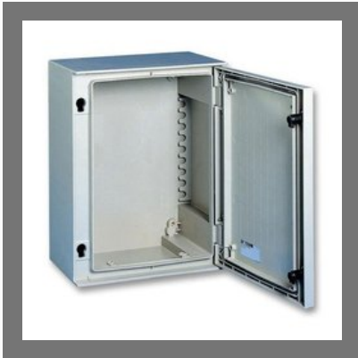
SS Box Enclosures