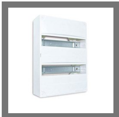
MS Automotive Empty Fuse Box