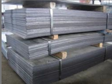
Hot Rolled Sheets