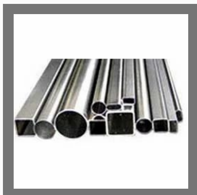
Square Hollow Section