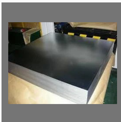
Cold Rolled Sheets