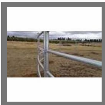
Metal Fencing Tube