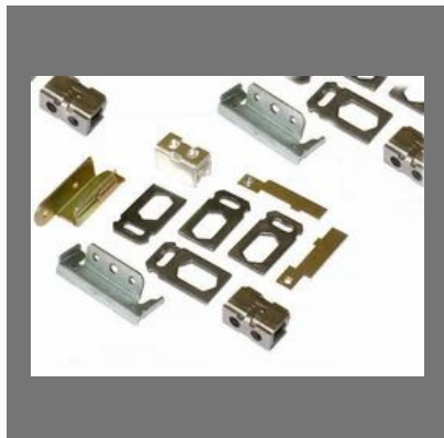
Sheet Metal Component