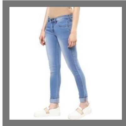
Ladies Regular Jeans