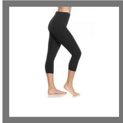
Ladies Cotton Capri