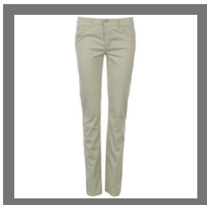
Ladies Plain Cotton Pant