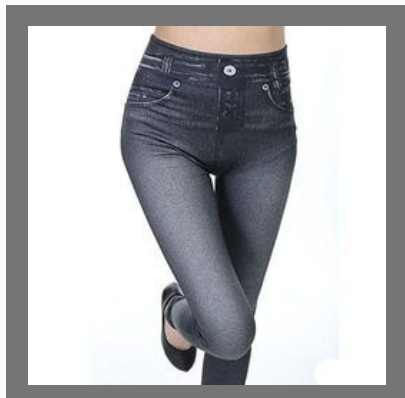
Ladies Stretchable Jeans