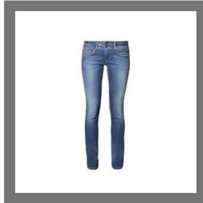
Ladies Slim Fit Jeans