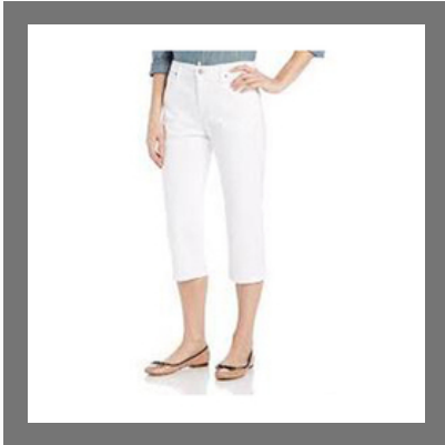
Ladies White Capri