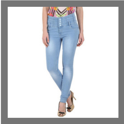
Ladies Trendy Jeans