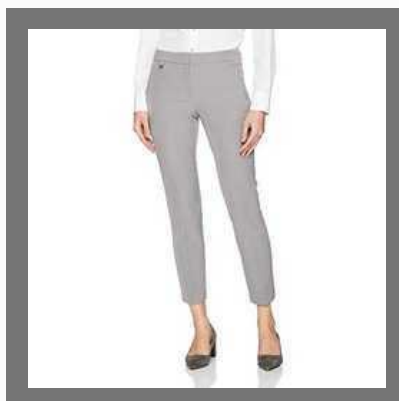
Ladies Cotton Pant