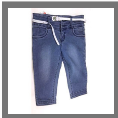
Ladies Denim Capri