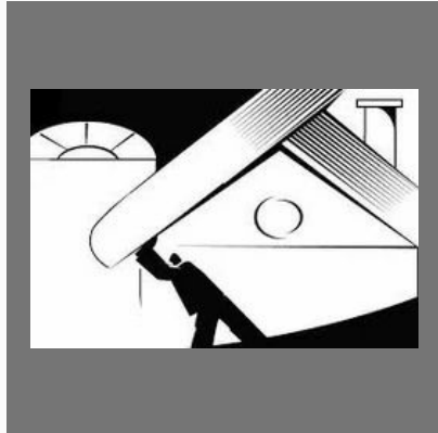
Excise Duty Consultancy Service