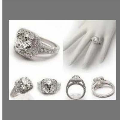
Conflict Free Diamonds