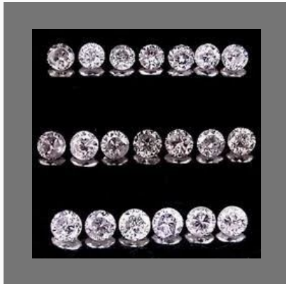
VVS Quality Diamonds