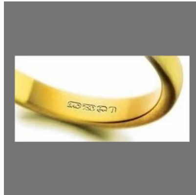
18k Hallmarked Gold