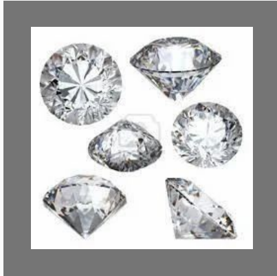
Brilliant Cut Diamonds