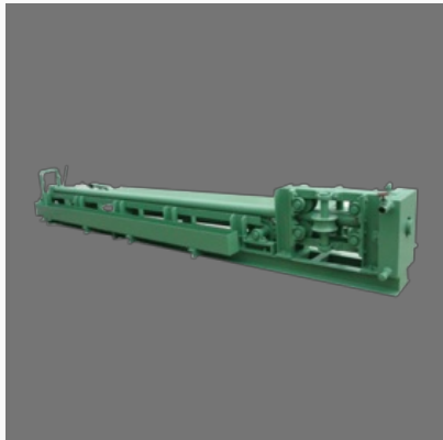
Ejector Rolling Mill