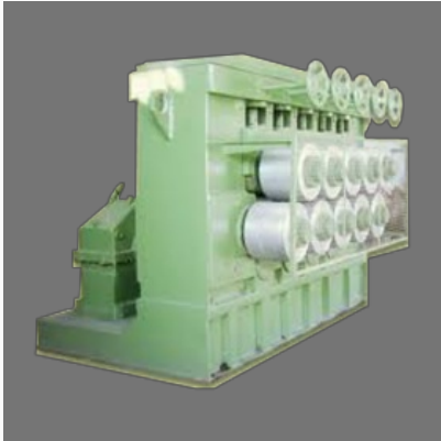
Straitening Rolling Mill