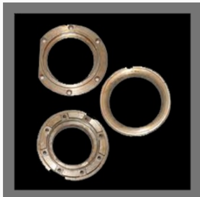
Bearing Choke Accessories