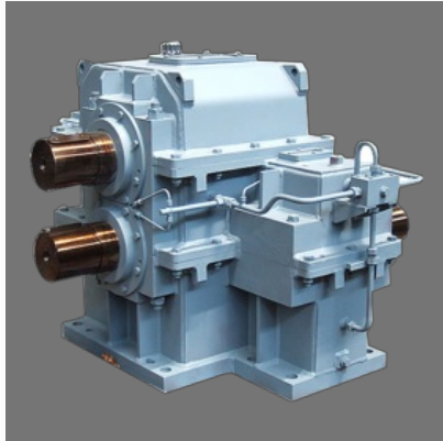
Pinion Gear Box