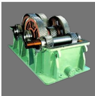
Reduction Gear Box