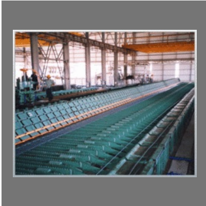
Automatic Rack Type Bed