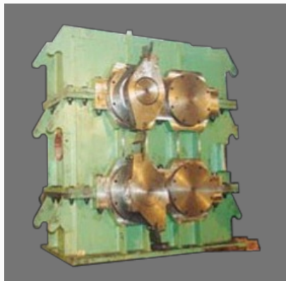
Crop Shearing Machines