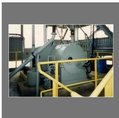
Pusher Rolling Mill