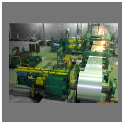
Coiler Coiling Machine