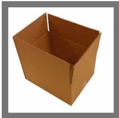
Brown Plain Corrugated Box