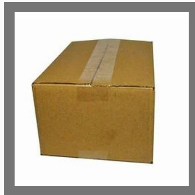
5 Ply Plain Corrugated Box