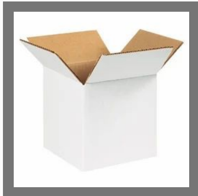
Plain Duplex Corrugated Box