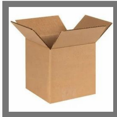
Plain Packaging Corrugated Box