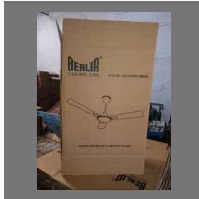
Ceiling Fan Box