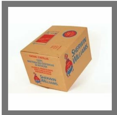
Printed Corrugated Packaging Box