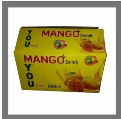
Soft Drink Packaging Corrugated Box