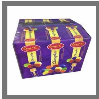
Confectionery Printed Corrugated Box