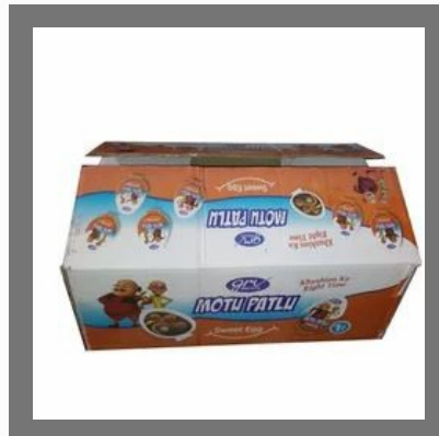
Chocolate Packaging Corrugated Box