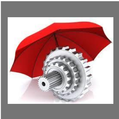
Machinery Break Down Insurance Service