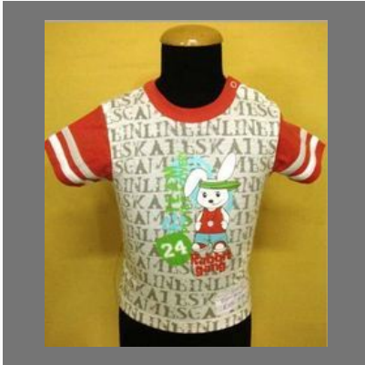
Boys T Shirts