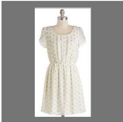
Ladies One Piece Dress