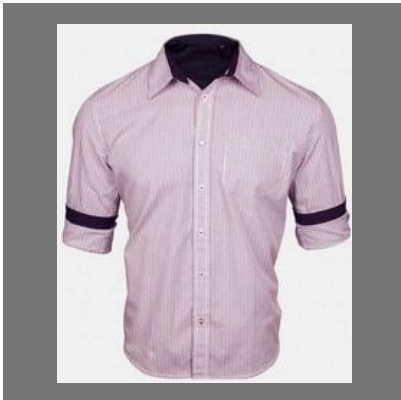
Mens Half Sleeve Shirts