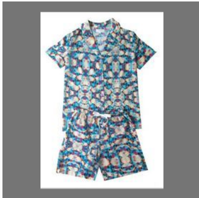
Ladies Night Wear