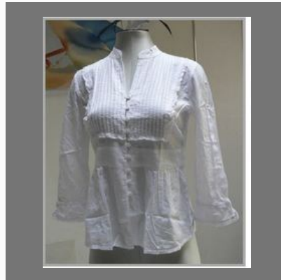
Ladies White Shirts