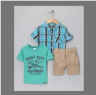
Boys Wear Set