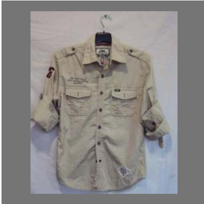
Mens Full Sleeve Shirts