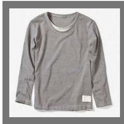
Mens Full Sleeve T Shirts