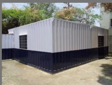
Bunk House Container