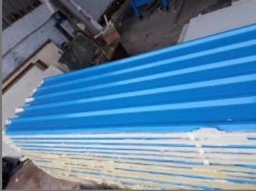
PUF Insulated Roofing Panel