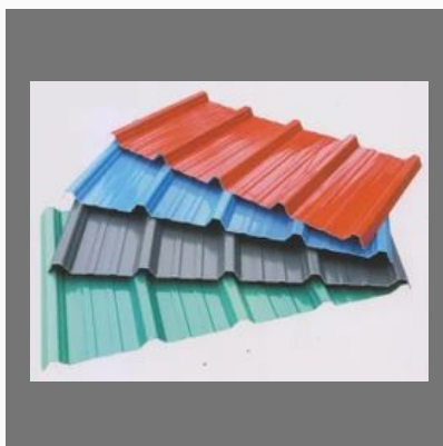
Insulated Roofing Panels