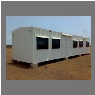
MS Portable Cabin