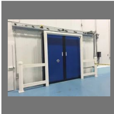
Cold Room Doors