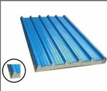
Sandwich PUF Panel