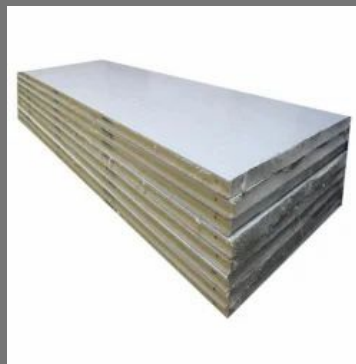
Cold Storage Insulated Panels