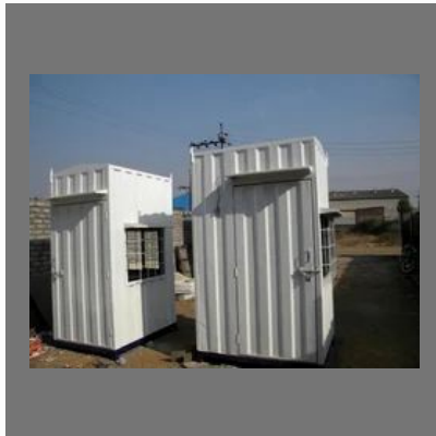
Portable Toll Booth Cabin