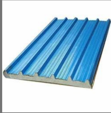
Cold Storage PUF Panel