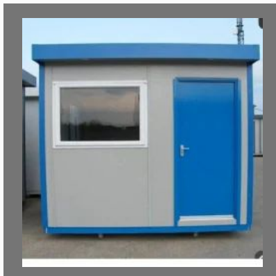
Prefabricated Security Cabin