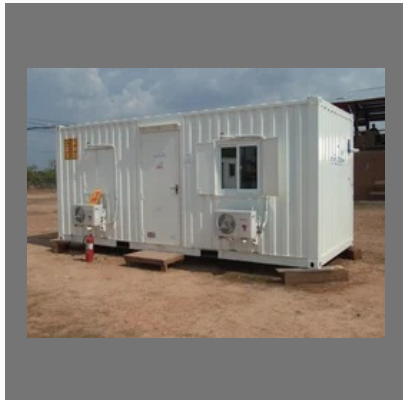
Laboratory Portable Cabins