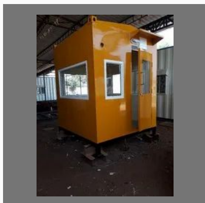
Color Coated Security Cabin