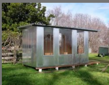
Aluminium Prefabricated Shelters