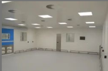
Walkable Ceiling Panel