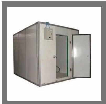
Cold Room Panels