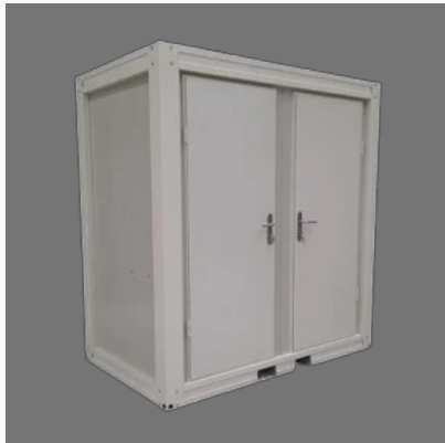
Portable Toilet Cabin