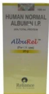
Alburel 20g Injection