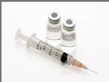
Meropenem Injection 1gm