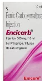
Ferric Carboxymaltose Injection