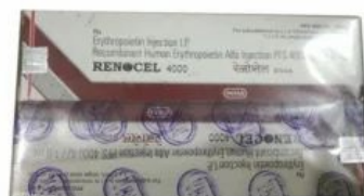
Renocel 4000 IU Injection