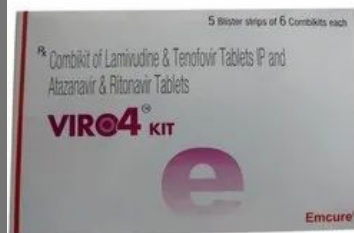
Viro 4 Kit Tablet