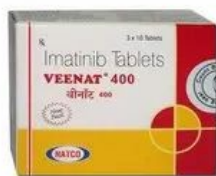
Veenat 400 Imatinib Tablets