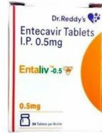
Entecavir Tablet IP 0.5mg