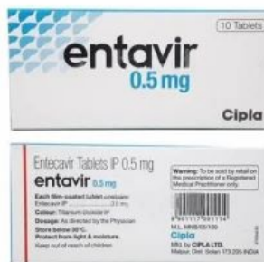
0.5 Mg Entecavir Tablets IP