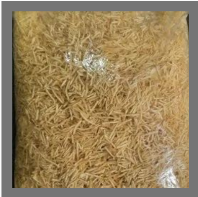
5 Kg Plain Aloo Lachha