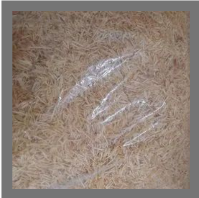
2.5 Kg Plain Aloo Lachha