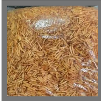
5 Kg Seasoning Mota Aloo Lachha