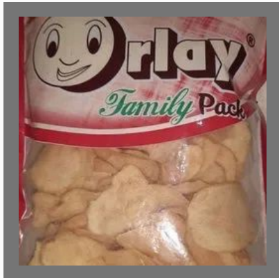
200 gm Plain Aloo Chips