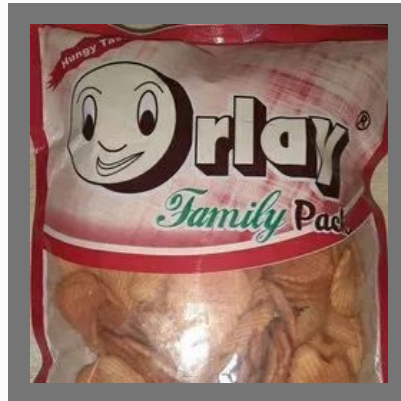
200gm Tomato Flavour Potato Chips