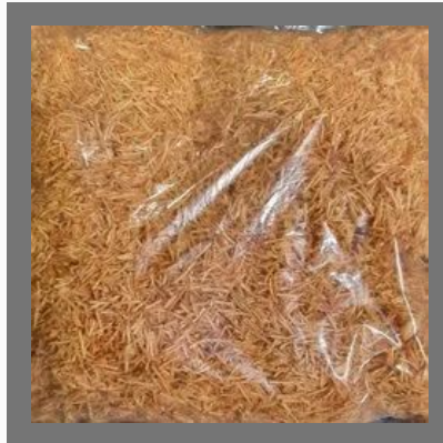
5 Kg Masala Aloo Lachha