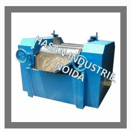
Laundry Soap Triple Roll Milling Machine