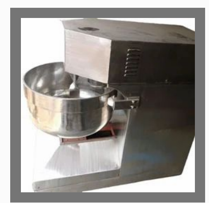
Bakery Commercial Stand Mixing Food Mixers Cake Dough Planetary Mixers Machine sale From India