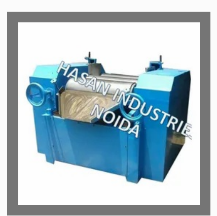
Three Roll Mill Wet Grinding Machine For High Pigment Triple Roll Mill From India