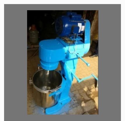
Planetary Mixer Machine