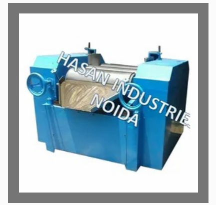
Triple Roll Soap Milling Machine Pigment Three Roll Mill Triple Roller Milling Machine From India