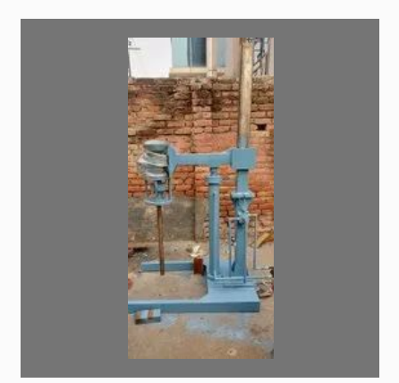
Low Budget High Dispenser