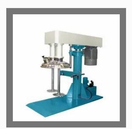
Twin Shaft Dispersers