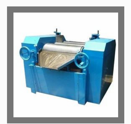
Triple Roll Machine