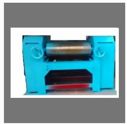
Triple Roll Mills