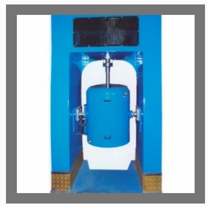
Attrition Mill Machine