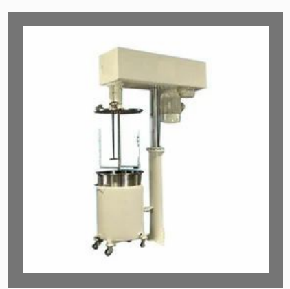
High Speed Disperser