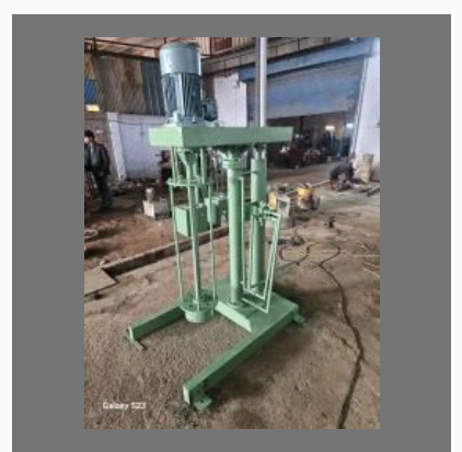
High Speed Dispenser