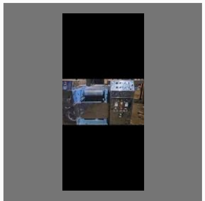
HYDROULIC TRIPLE ROLL MILL