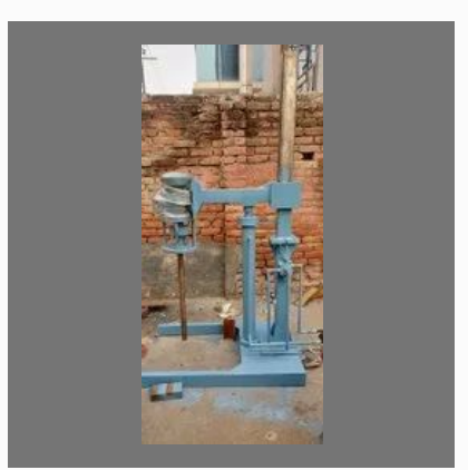
Hydraulic Disperser Stirrer Mixer Electric Overhead Stirrer 500L 1000L Hydraulic Stirrer From India