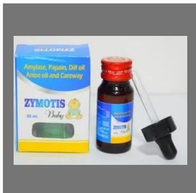
Enzyme Drops ( Paediatric Use)