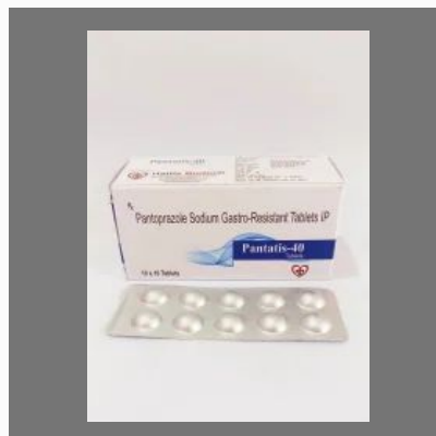
Pantoprazole 40 mg Tab