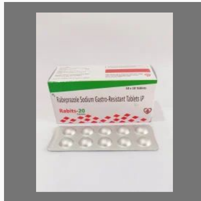
Rabeprazole 20Mg Tab