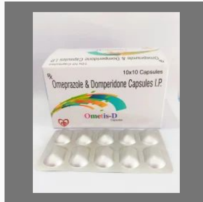
Ometis D Capsule