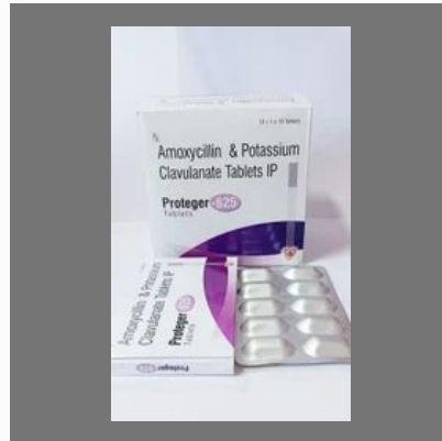
Amoxicillin, Potassium Clavulanate & Lactic Acid Bacillus Tablets