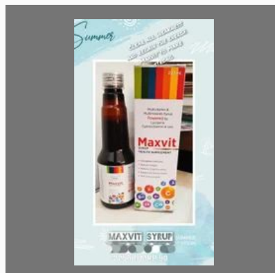
Multivitamin Multimineral With Methylcobalamin, Lycopene & Zinc Syrup