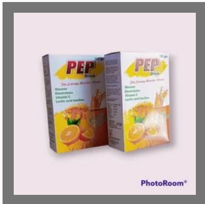
Energy Drink (PEP)