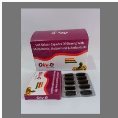
Multivitamin with Ginseng Lysine Leutien