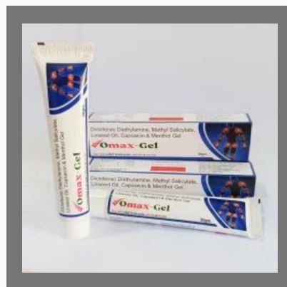
Diclofenac Gel (Omax Gel)