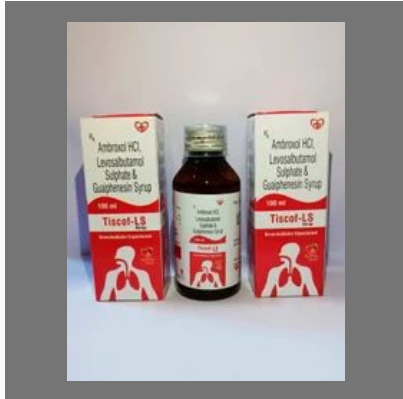
Ambroxol, Levosalbutamol, Guaiphenesin Syrup