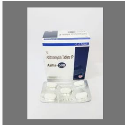
Azitis-500 Azithromycin 500mg Tablets, 3 Tablets