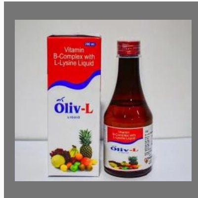
B Complex With L Lysine Syrup