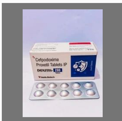
Cefpodoxime Proxetil 200 Mg Tablets