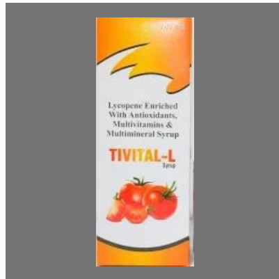
Lycopene with Multivitamins & Multiminerals