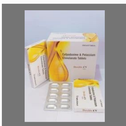
Cefpodoxime Proxetil Clavulanic Acid Tablets (Doxitis CV)