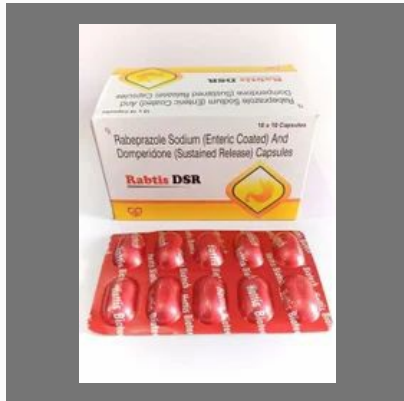
Rabti DSR Capsule