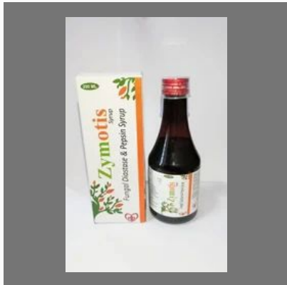
Fungal Diastase & Pepsin Enzyme Syrup