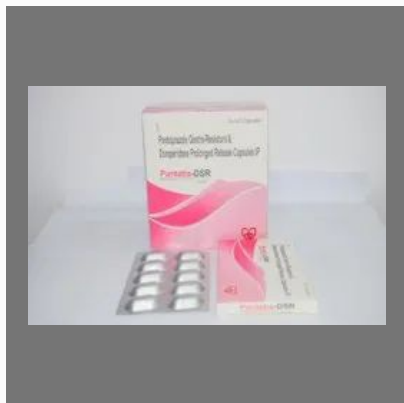
Pantoprazole Domperidone SR Capsule