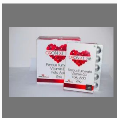
Iron And Folic Acid Tablets