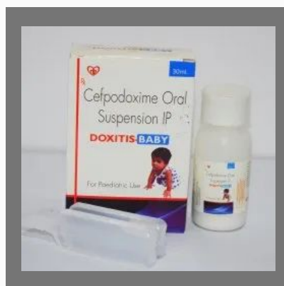
Cefpodoxime Oral Suspension Ip.