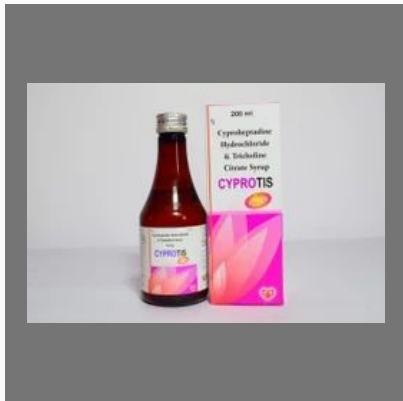
Cyproheptadine Hcl Tricholine Syrup