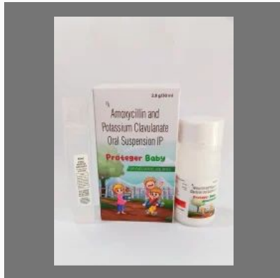
AMOXICILLIN + CLAVULANATE POT. DRY SYP (Proteger Baby)