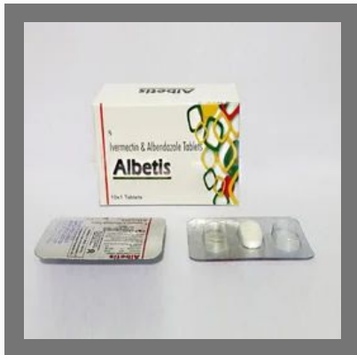
Albetis Ivermectin & Albendazole 12mg Tablets, 1 Tablet