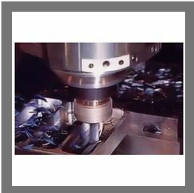
Milling Job Work