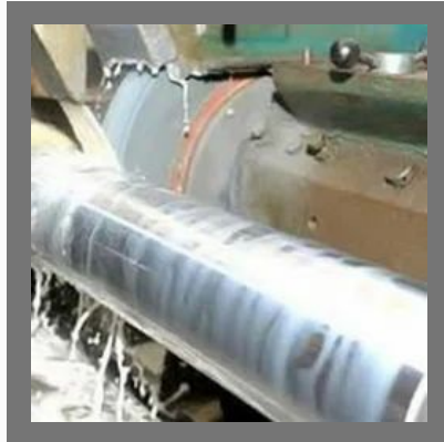
Grinding Job Work