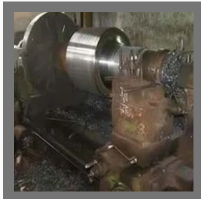
Lathe Machine Job Work