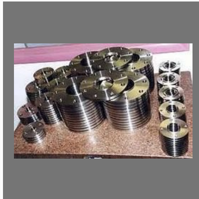
Stainless Steel Flanges