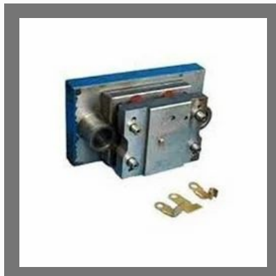
Press Tool Dies