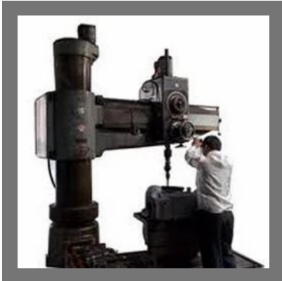
Drilling Job Work