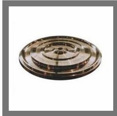
Stainless Steel Flanges