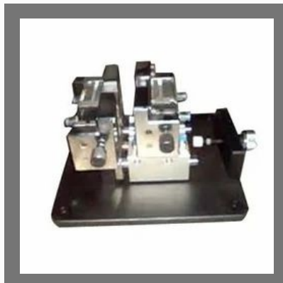
Jigs & Fixtures