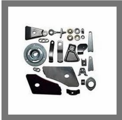
Sheet Metal Pressed Components