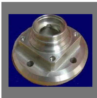
Lathe & Milling Work