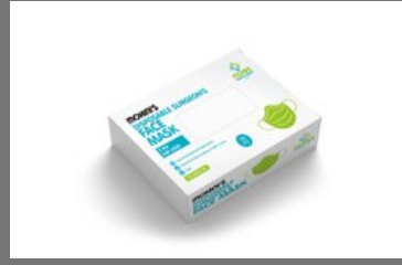
N95 Face Mask