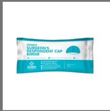
Disposable Surgical Cap