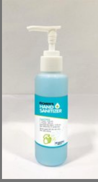
Disposable Mask Hand Sanitizer Surgical Caps Disposable Apron Pp Kit