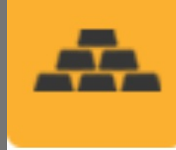
Commodity Trading Service