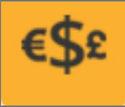
Currency Trading Service