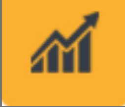
Equity Trading Service