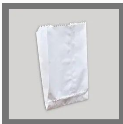
100% Food Grade White Paper Bag