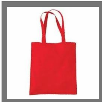
Cotton Carry Bag