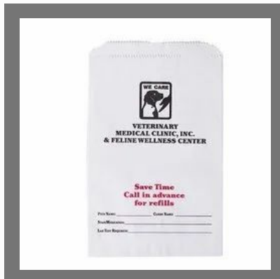
Medicine Packaging Paper Bag