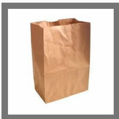
Kraft Paper Grocery Bag