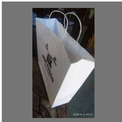
White Paper Bag