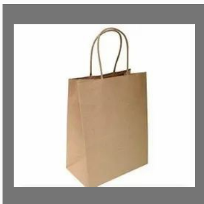
Craft Paper Carry Bags