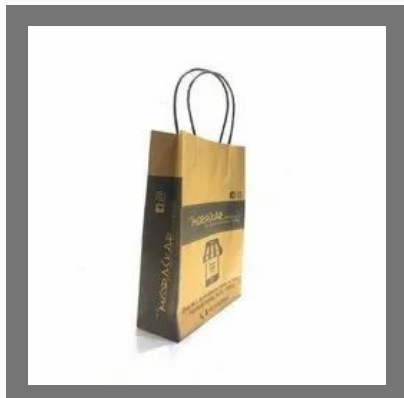
Printed Paper Shopping Bag