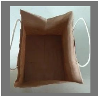
Parcel Paper Bags