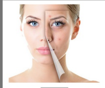
Skin Care Services