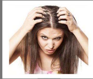
Hair Care Services