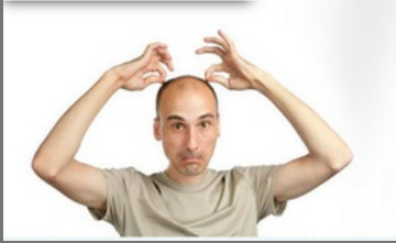
Stem Cell Therapy Service