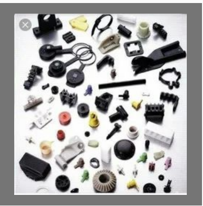
Plastic Molding Parts