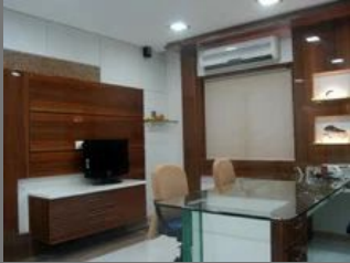
Office At Nariman Point