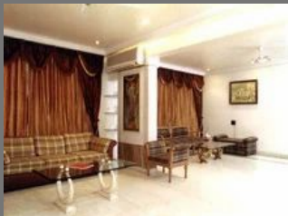
Residence At Juhu Interior