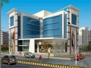
Vega The Mall