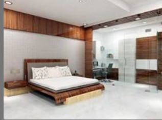
Apartment in Mumbai