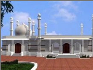
Uvaisia Roohani Ashram Ajmer