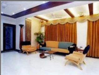
Residence At Matunga