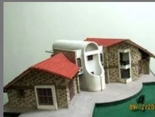
Bungalow at Karjat