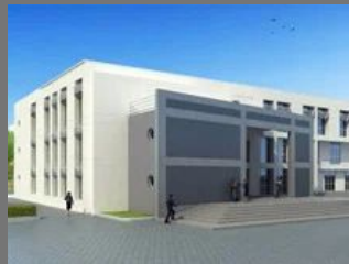
Mittal College at Ajmer