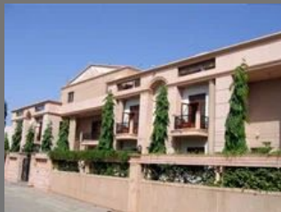
Mittal House At Ajmer