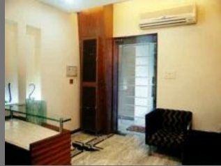
Office At Andheri