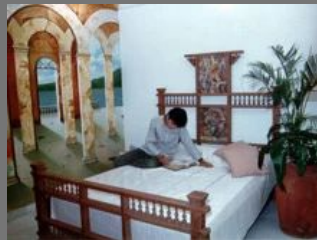
Residence At Nepean Sea Road