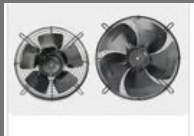
Large Axial Fans All Metal