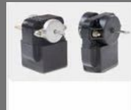
C Frame Motors