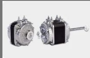
Shaded Pole Motors - Q Type