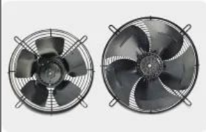
Axial Fans - Metal Blades