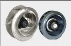
Backward Curved Fans