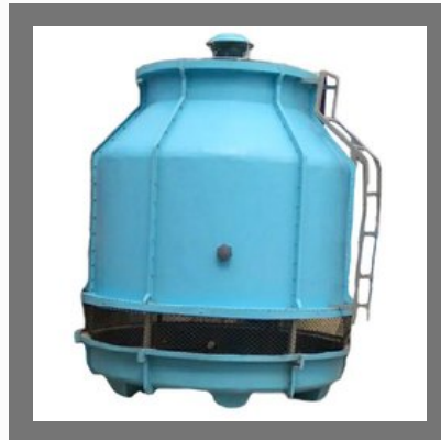
FRP Cooling Tower