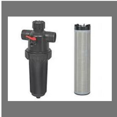
Plastic Screen Filter