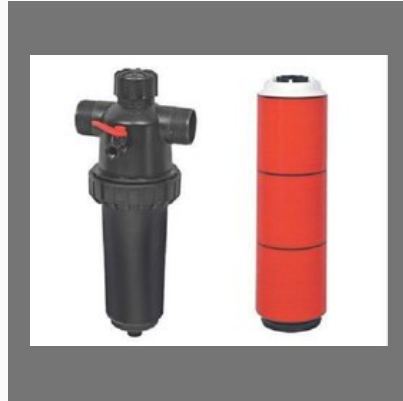
Plastic Disc Filter