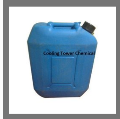
Cooling Water Treatment Chemicals