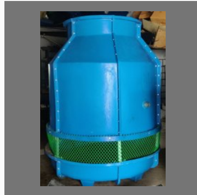
Frp Induced Draft Cooling Tower