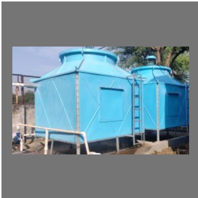
Square Type Cooling Tower