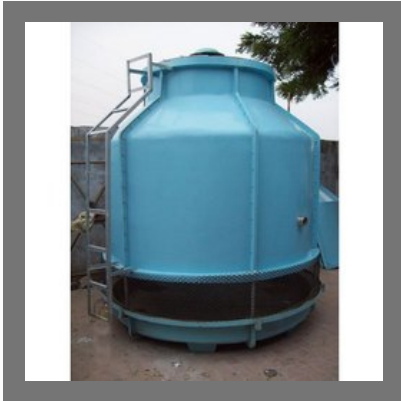
Water Cooling Tower