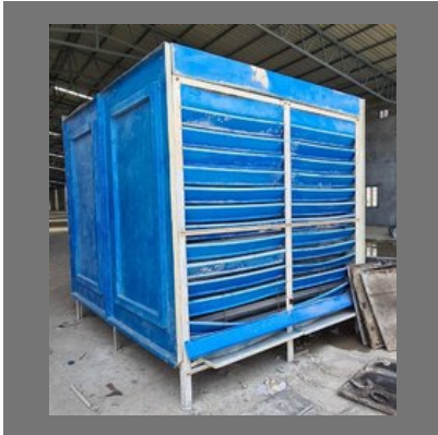
Cooling Tower Repairing Services