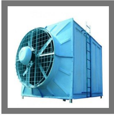
Frp Cross Flow Cooling Tower