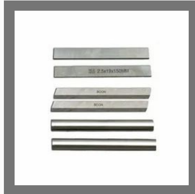
Tool Bit Blanks