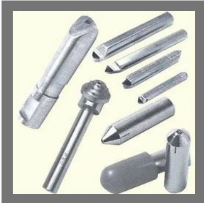
Carbide Tipped Cutting Tools