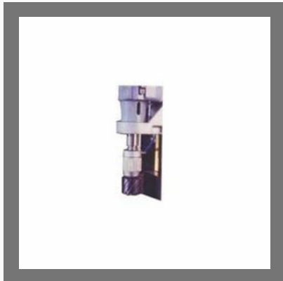
Core Drilling Tool