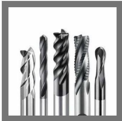
Coated Solid Carbide End Mills