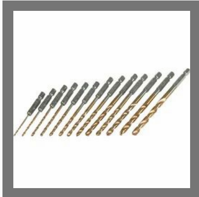
High Speed Steel Drills