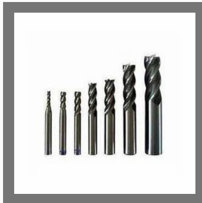
Parallel Shank Roughing End Mills