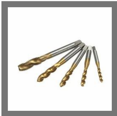
High Speed Steel Drilling Taps