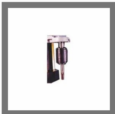
Thread Cutting Tool