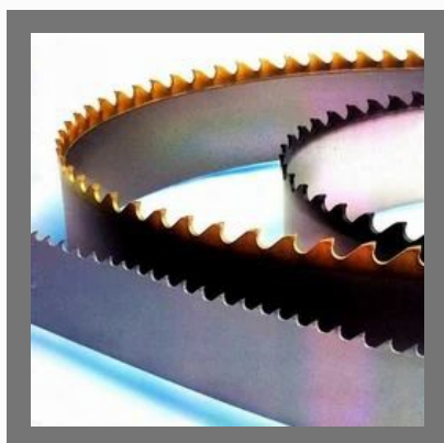
Bimetal Bandsaw Blades