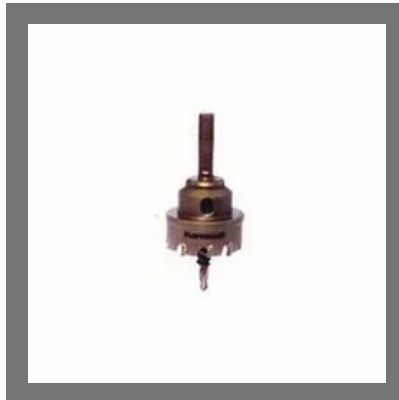
Heavy Duty Power Max 55 Tool