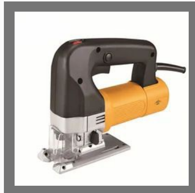
Power Cutting Tools