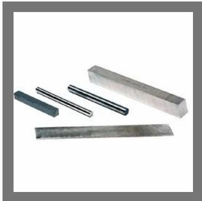
High Speed Steel Tool Bits