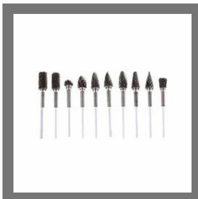
Tungsten Carbide Rotary Burrs