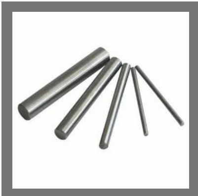
Drill Bit Blanks