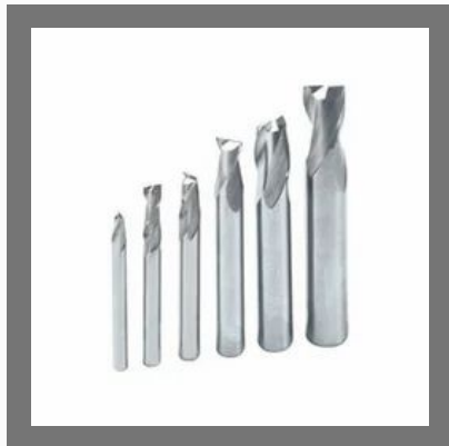
HSS End Mills