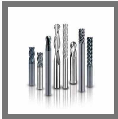
Solid Carbide End Mills