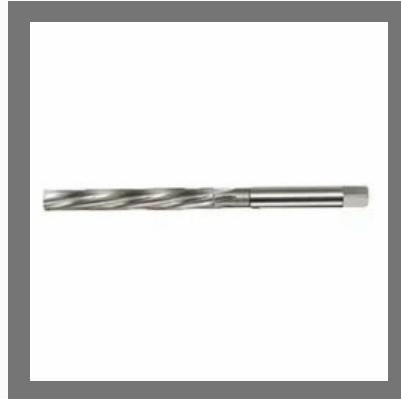
High Speed Steel Carbide Reamers