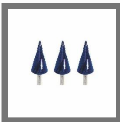
Step Drill Cutter