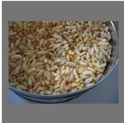
Mamra Puffed Rice