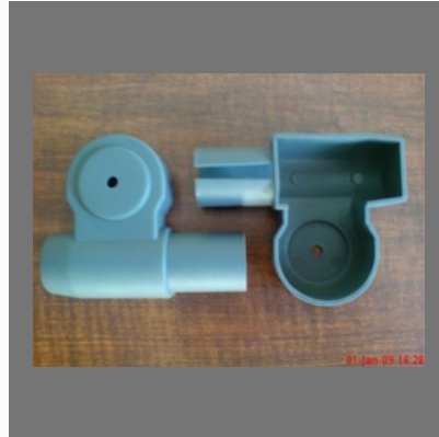
Terminal Cover Left & Right