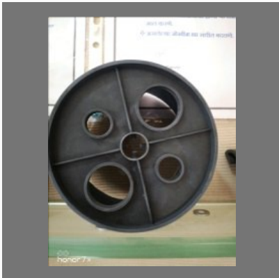
Plastic Capacitor Cap