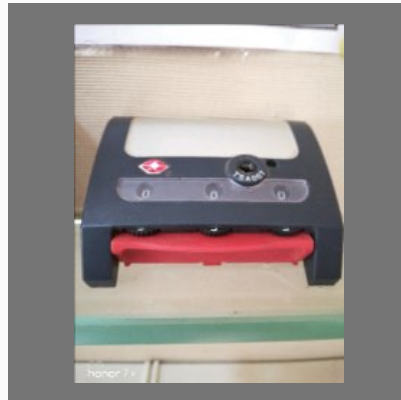
Travelling Bag Lock