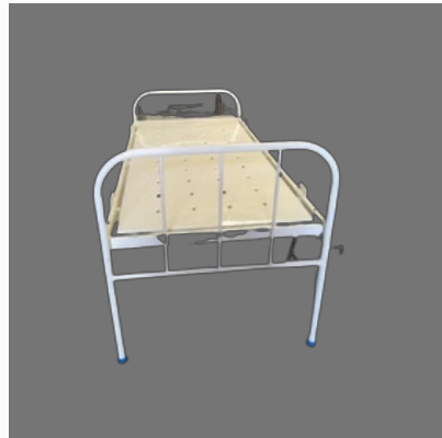
HHC 144 Hospital Quarantine Beds