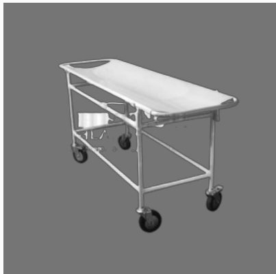
110kg Patient Stretcher Trolley