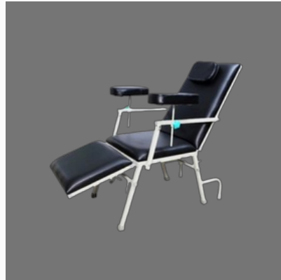
HHC 261 Blood Donor Chair