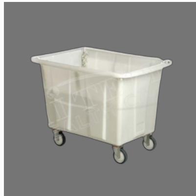
Hospitals Wet Linen Trolley