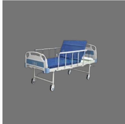
ICU Fowler Hospital Bed