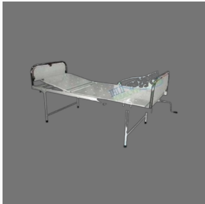
Manual Semi Fowler Bed