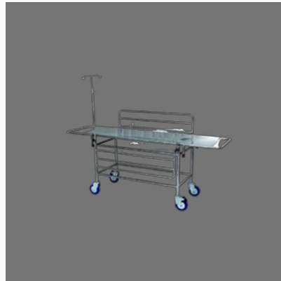
SS Patient Stretcher Trolley