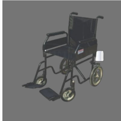
HHC 222 Commode Wheel Chair