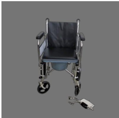
Manual Attendant Commode Wheelchair