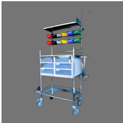
Trauma Care Medicine Trolley