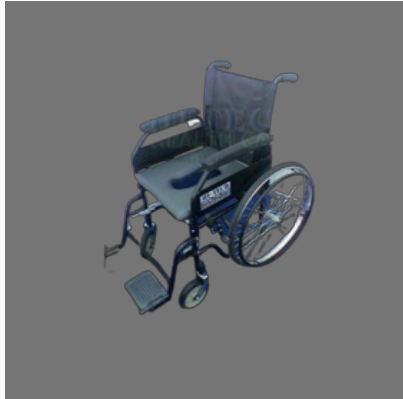
HHC 211 Folding Wheelchair