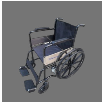
Heavy Duty Commode Wheelchair