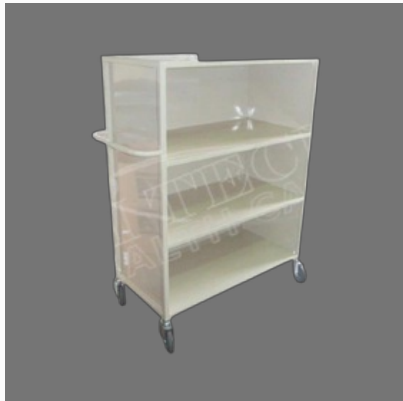
Hospital Surgical Instrument Trolley