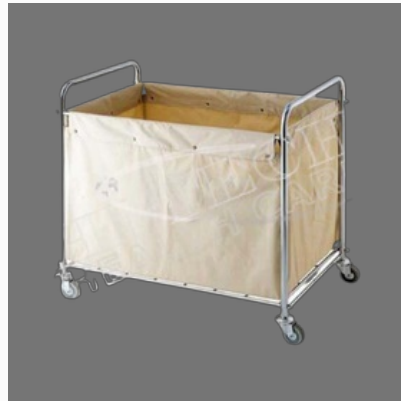
Room Service Trolley