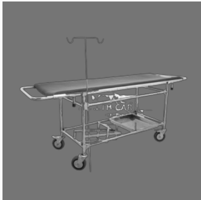
120kg SS Patient Stretcher Trolley