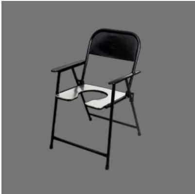
Portable Commode Chair