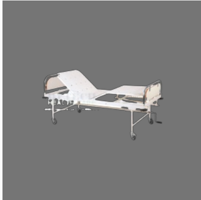
SS Hospital Fowler Bed