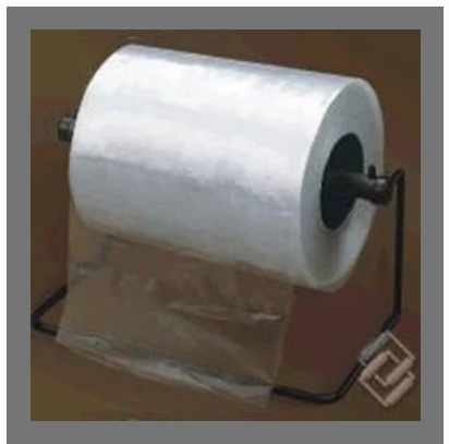
Clear Plastic Roll