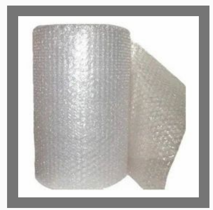
Air Bubble Roll