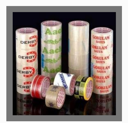
Printed Bopp Tape