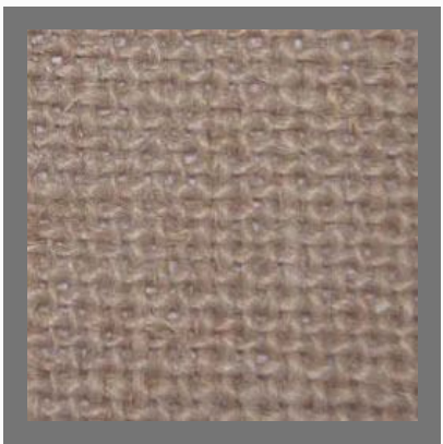
Fine Jute Cloth