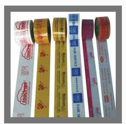
Industrial Printed Bopp Tapes