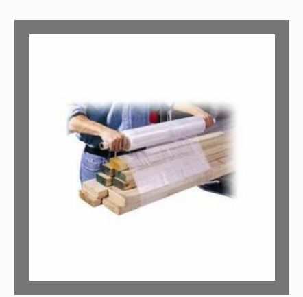
Plastic Shrink Film Roll