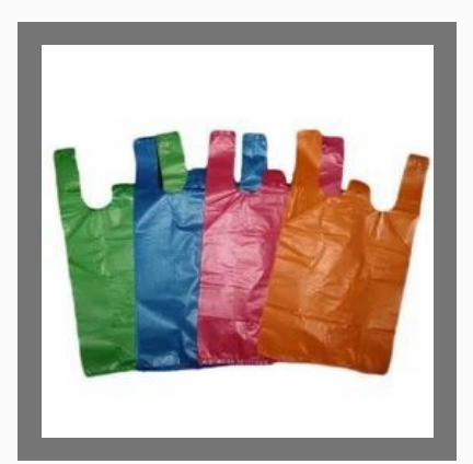
Hm Plastic Bag