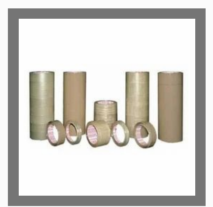
Plain Bopp Tape