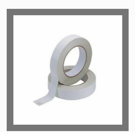
Double Sided Tissue Tape