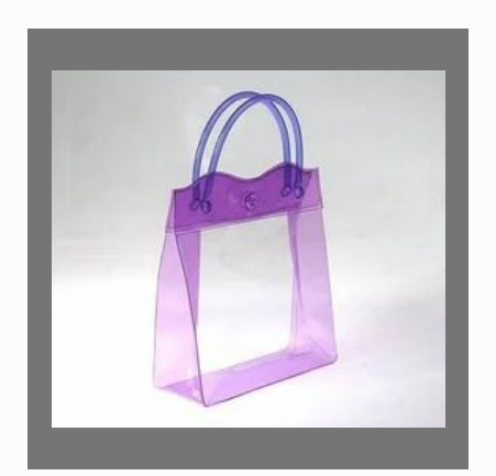
Ld Plastic Bag