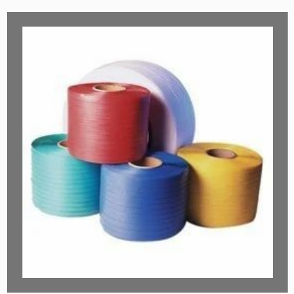
Box Strapping Roll