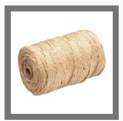
Natural Jute Twine