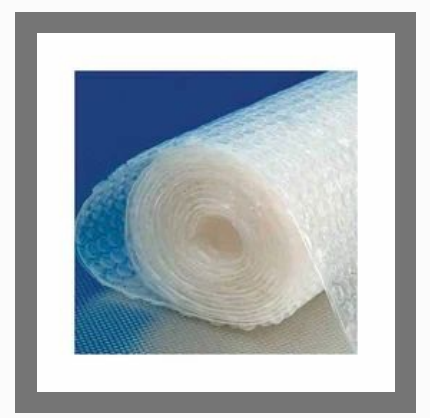
Industrial Air Bubble Roll