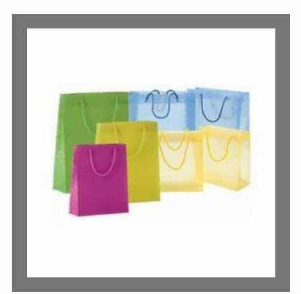
Pp Plastic Bags