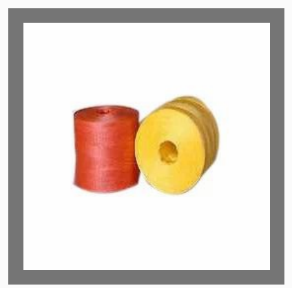
Colored Plastic Sutli