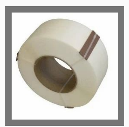
Heat Sealing Box Strapping Roll