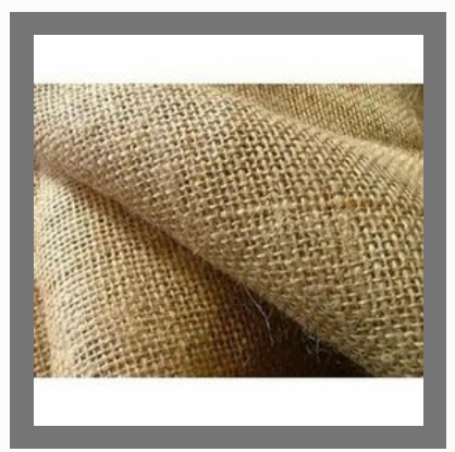
Jute Hessian Cloth