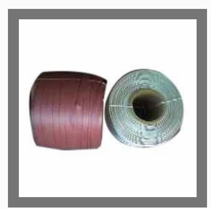
Pp Plastic Sutli