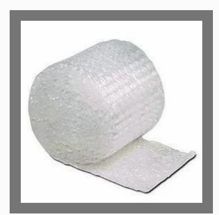
Air Bubble Film Roll