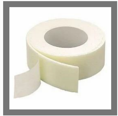
Double Sided Foam Tape