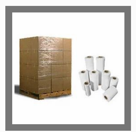
Plastic Stretch Film Roll