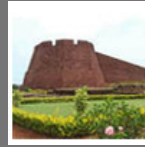
Citadel of Waves