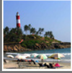
Sun & Sand Packages Tours