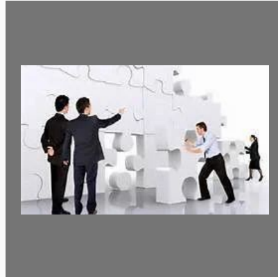
Corporate Restructuring Service