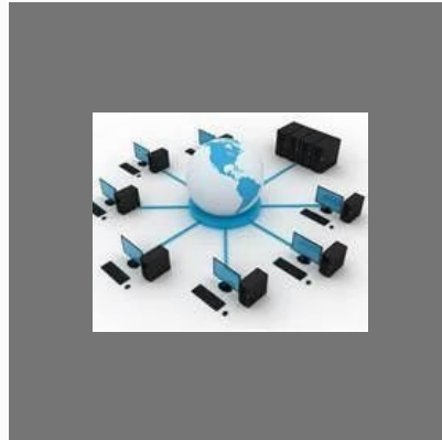
Network Support Services