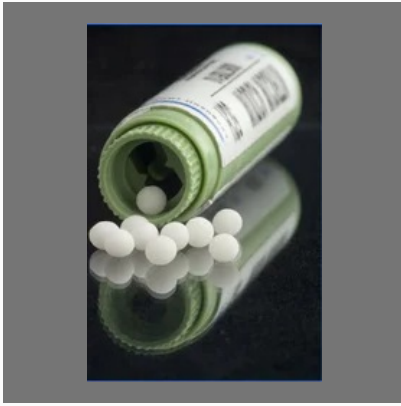
Homeopathic Treatment For Stomach