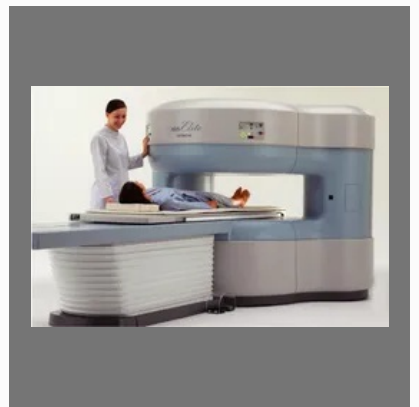
Hitachi Airis Elite MRI Machine