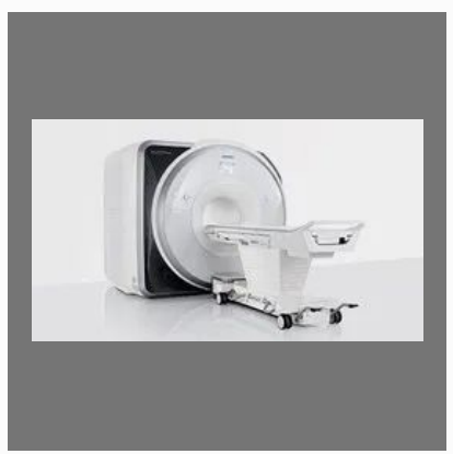
Siemens 3T MRI Machine