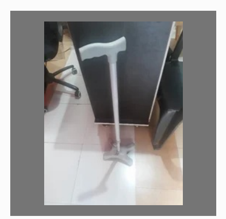
Quadripod Walking Sticks