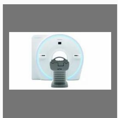
Toshiba 3T MRI Machine