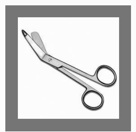
Lister Bandage Scissors