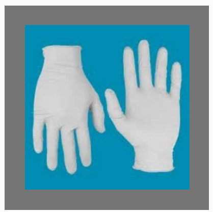
Plastic Examination Gloves