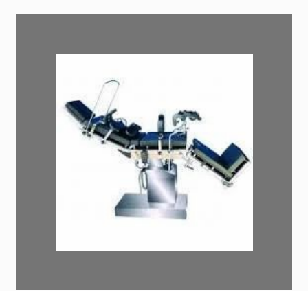
Hospital Operating Table