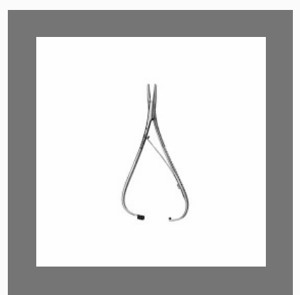
Mathieu Needle Holders