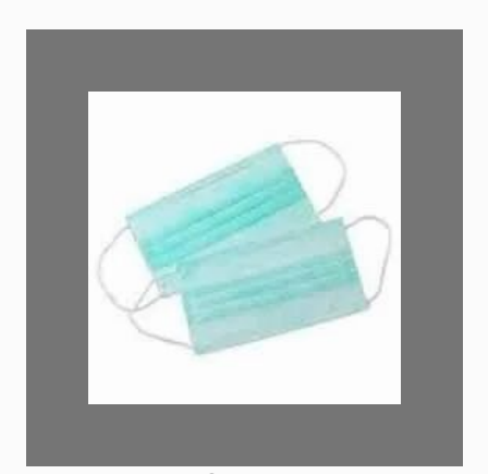
Disposable Surgical Mask