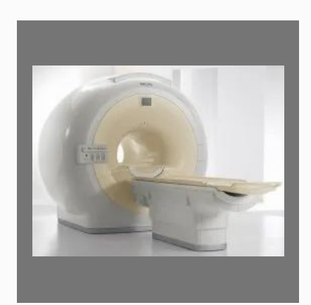
Philips Achieva 3T MRI Machine