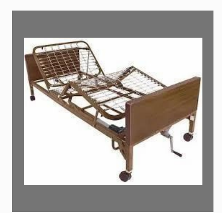
Adjustable Hospital Bed