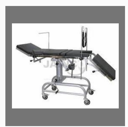
Operation Theater Furniture