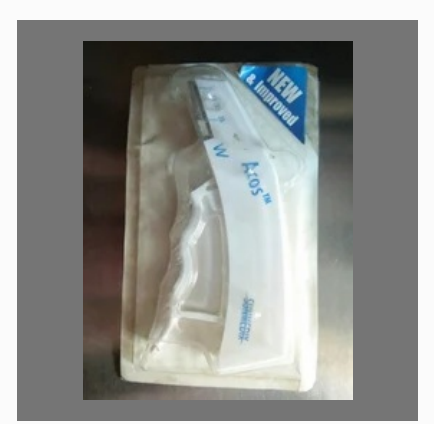
Stitches Stapler Remover