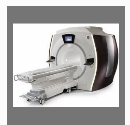
GE 3T MRI Machine