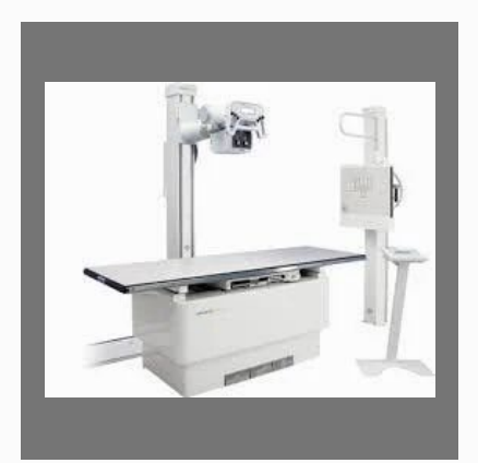
X Ray Machine