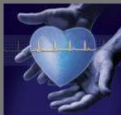
Ecg, Spirometry, Eeg