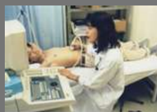
Non Invasive Ventilation (Niv)