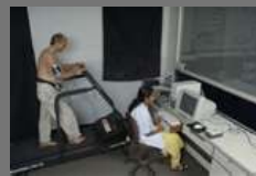
TMT (Tread Mill Test)