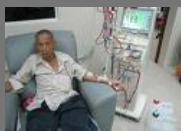
Nephrology & Dialysis