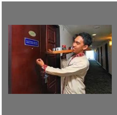
24 Hours Room Service