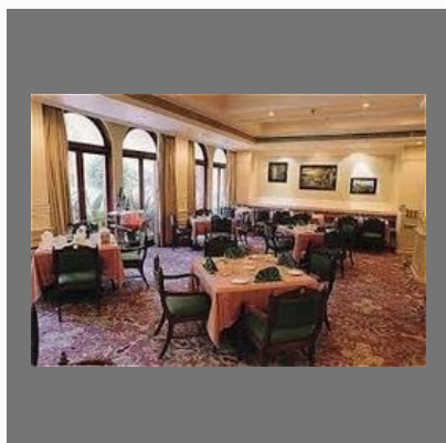
Direct Dialing Facility With STD/ISD/Fax