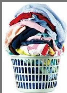
Same Day Laundry Services