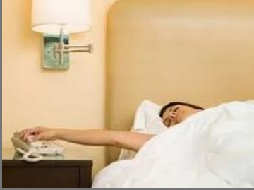
Morning Wake Up Service