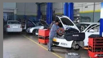
Pick Up And Drop Facility (Chargeable)