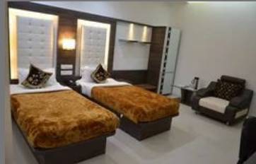
Air-conditioned Deluxe Rooms