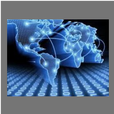
Internet & Wi-Fi Connectivity In Entire Hotel