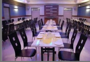
Restaurants Booking Services