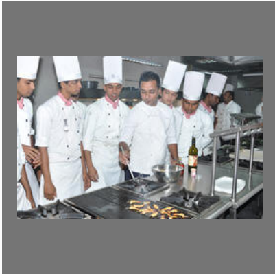
Advanced Training Kitchen