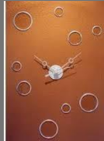
Check-Out Facility Service