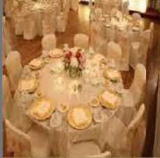
Banquets Facility Service