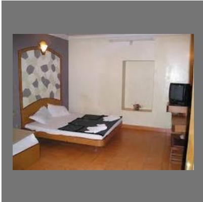
Deluxe Non AC Room Facility