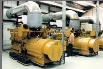
Generator Backup Facility Service