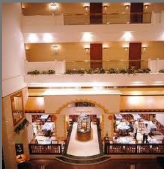
Complimentary Buffet Breakfast Facility Service