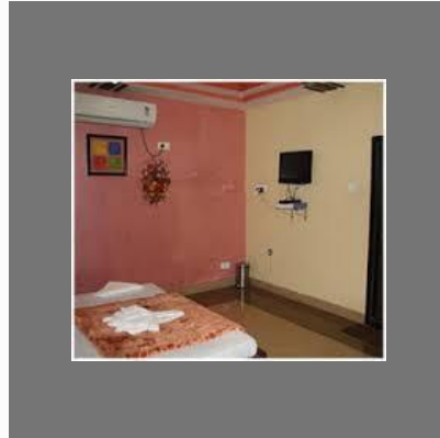
Executive AC Room Facility