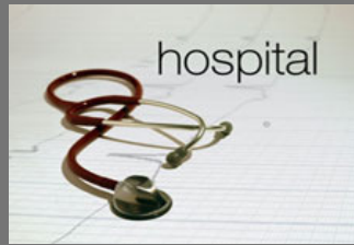
Hospital And Doctors