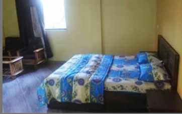
Deluxe AC Room Service