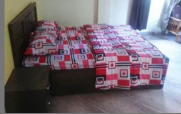
Exclusive AC Room Service