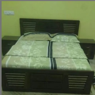
Deluxe Room Service