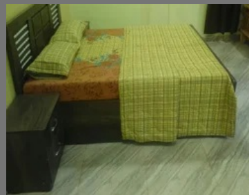
Suite Room Service