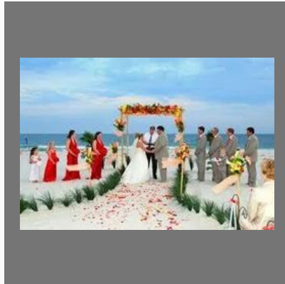
Open Air Sitting