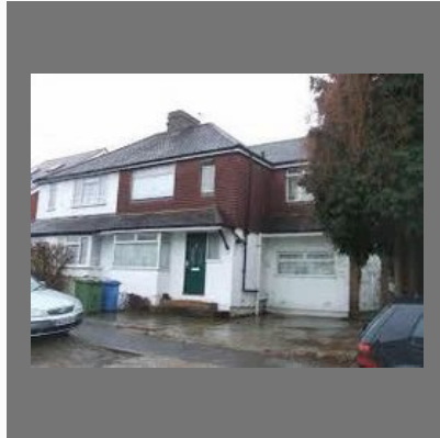
Comfortable, Well Furnished, Neat And Clean Roms